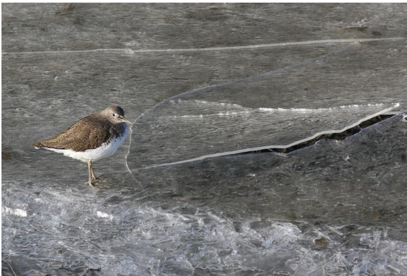
Green Sandpiper at Botolph's Bridge (Brian Harper)