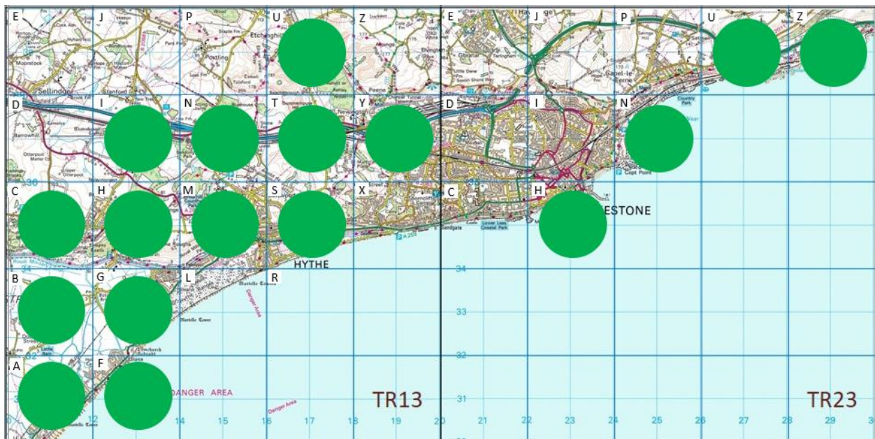
Figure 1: Distribution of all Green Sandpiper records at Folkestone and Hythe by tetrad

Figure 1 shows the distribution of all records of Green Sandpiper by tetrad, with records in 17 tetrads (55%).