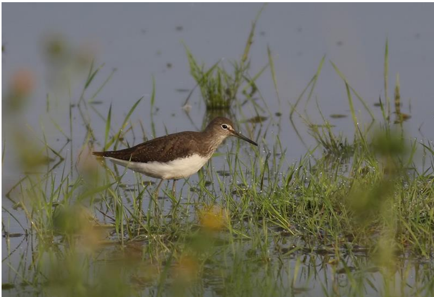
Green Sandpiper at Nickolls Quarry