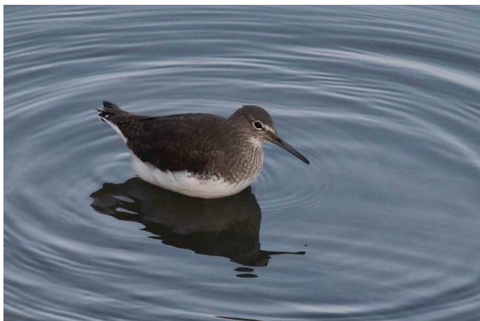
Green Sandpiper at Botolph's Bridge (Ian Roberts)