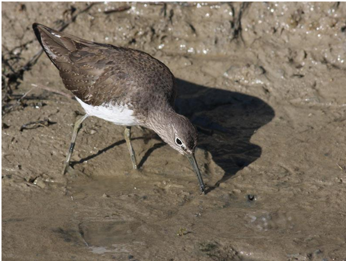
Green Sandpiper at Botolph's Bridge (Brian Harper)

Few autumn migrants are noted away from the marsh, with on average 1 or 2 records per annum, typically involving single birds although three flew west at Copt Point on the 13 th August 1999, two flew west at Capel Battery on the 11 th September 1999, two flew south over Capel-le-Ferne on the 13 th August 2000, two were in a flooded field at Abbotscliffe on the 8 th August 2011, two were on a small pond at Samphire Hoe on the 27 th August 2013 and three flew west over Beachborough Lakes on the 17 th August 2016.