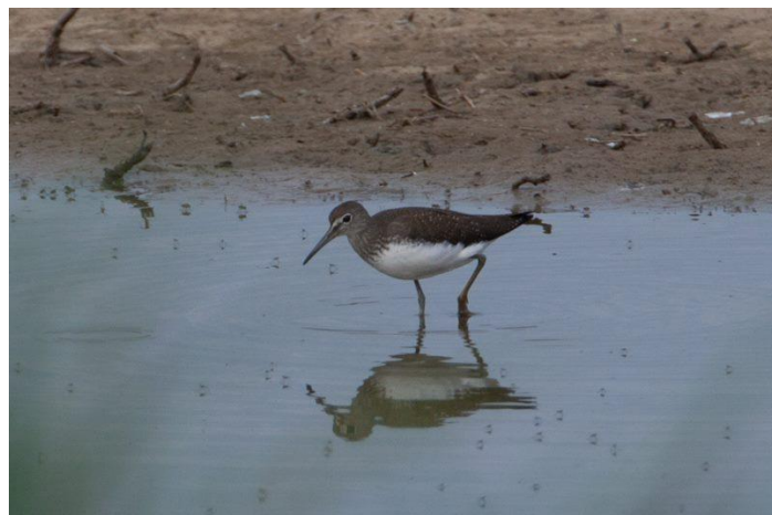
Green Sandpiper at the Willop Basin (Paul Apps)