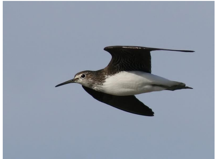
Green Sandpiper at Botolph's Bridge (Brian Harper)

At least two birds tend to overwinter and frequent the Nickolls Quarry/Botolph's Bridge/Donkey Street area, with a peak of four present during the 2000/2001 winter. Winter records are rare away from the marsh and the only sightings in recent years (excluding a couple of fly-overs) have involved one frequenting a small pool to the east of Cowtye Wood between the 19 th January and 9 th February 2014, one along the stream near Kiln Wood on the 13 th January 2019 and one at the spring at Holy Well from the 10 th to 12 th February 2021 during a period of severe weather.