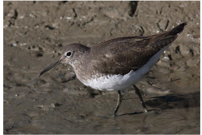
Green Sandpiper at Botolph's Bridge (Brian Harper)

In Kent it is a regular passage migrant and winter visitor (KOS, 2020).