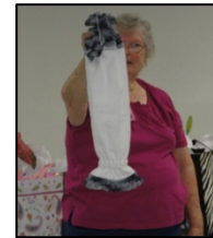
Pat Horn's Bag Storage Bag