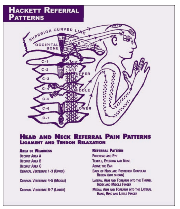
FIGURE 3. Head and neck referral pain patterns. From Hauser, "Prolo Your Pain Away," Second Edition. 2004. Beulah Land Press. Oak Park, IL. Used with permission.

Prolotherapy has been used to successfully treat a large variety of musculoskeletal syndromes, including cervical, thoracic and lumbar pain syndromes, patients diagnosed with "disc disease," mechanical low back pain, plantar fascitits, foot or ankle pain, chronic rotator cuff or bicipital tendonitis/tendonsis, lateral and medial epicondylitis, TMJ dysfunction, musculoskeletal pain related to osteoarthritis, and even finger or toe joint pain including "turf toe." It is important to rule out a systemic or non-musculoskeletal origin for the complaints, confirm no underlying