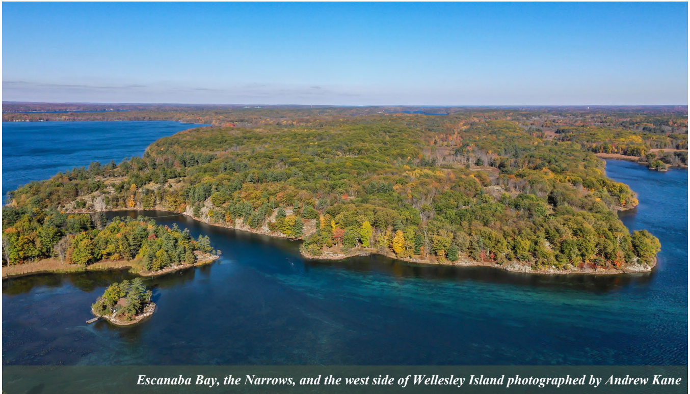
Escanaba Bay, the Narrows, and the west side of Wellesley Island