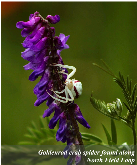
Goldenrod crab spider found along North Field Loop