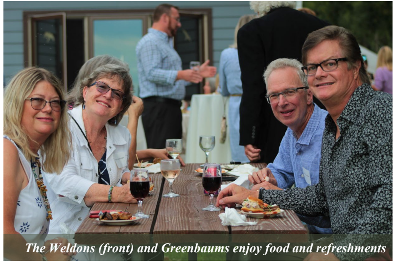
The Weldons (front) and Greenbaums enjoy food and refreshments