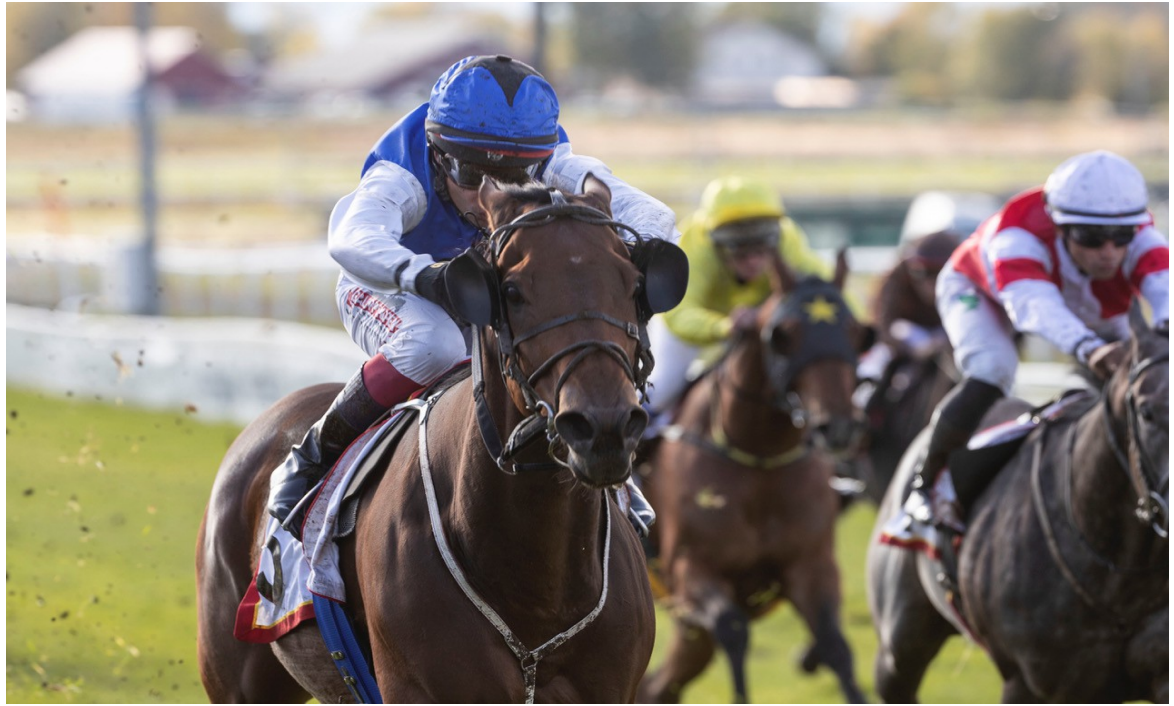
A determined champion.

Captain America is now on handicap 92, as high as he has ever been through a career spanning 63 starts with 17 wins and 2.372.219 kroner in total earnings. There should be more to come.