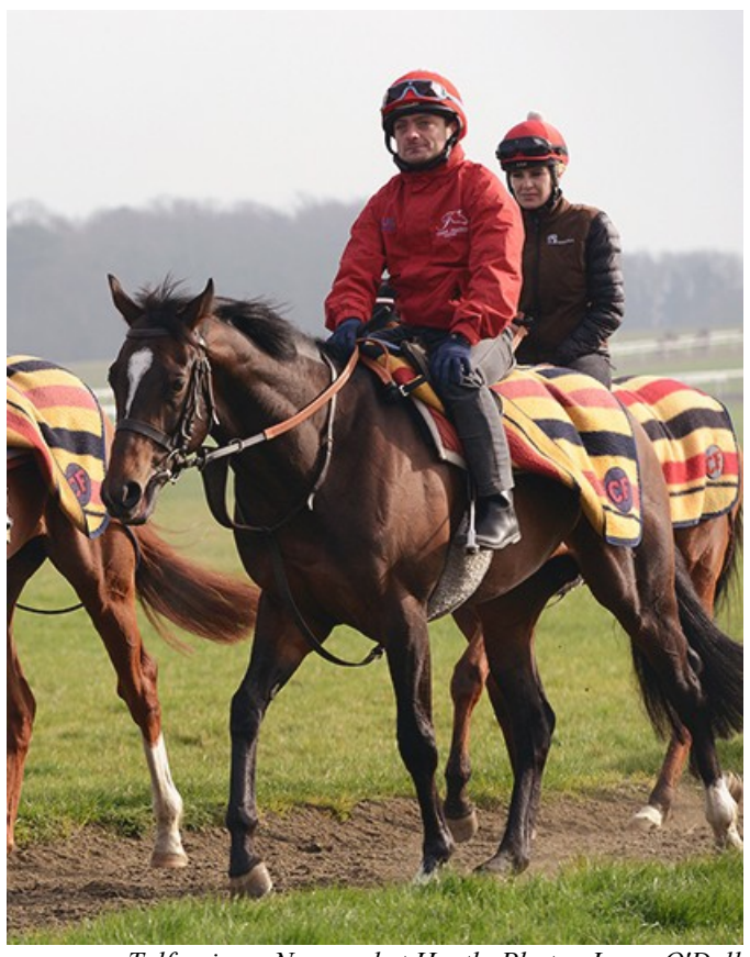
Tulfarris on Newmarket Heath.

After racing prominently throughout, he went down by only a head to the Hamdan Al Maktoum owned Sawwaah that day. The two had a real battle through the final furlong, and they drew right off, finishing 3 lengths clear of the third placed Model Guest. Although subsequent results gave us mixed messages about the form (which is often the case