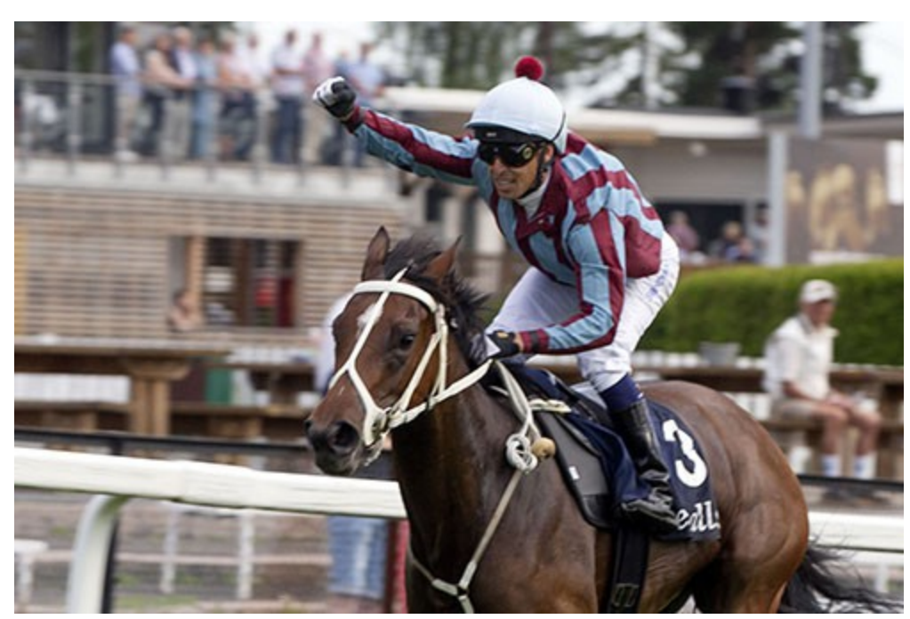
1,000 Guineas winner!

Unwanted Beauty was a bit of a surprise as she burst on to the top scene with an impressive win in the Tattersalls Norwegian 1,000 Guineas at Øvervoll last June. That she also gave Annike her first classic winner was a bonus. Perfectly ridden by Sandro De Pavia, Unwanted Beauty proved way too good for her eight rivals in the Guineas, run over a good turf course. She outclassed For The Roses, a nice shipper from Sweden, to win the race by 3 ½ lengths, looking like she had more in hand as she passed the winning post. It was second start Norway, coming just over