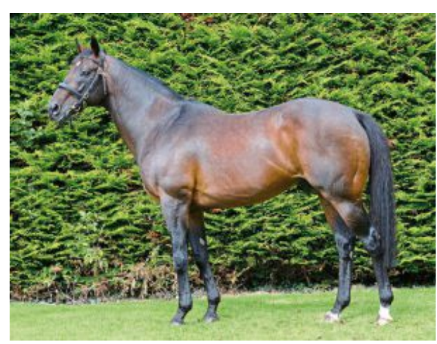
Crystal Park's sire Youmzain

A daughter of the top class middle distance performer Youmzain, Crystal Park is an unraced three-year-old filly bought from German trainer Andreas Wohler at last year's Tattersalls Horses In Training Sales in Newmarket. She is a daughter of Crystal Diamond, a Teofilo mare who became a Listed winner in France. Crystal Diamond won four times, and her finest hour came when she closed her career out by capturing the Prix Belle de Nuit (LR) over 2500 metres at Saint-Cloud as a three-year-old. She was also placed four times, running second in the Prix Scaramouche (LR) over 2800 metres at the same venue, and third in the Prix Vulcain (LR) over 2500 metres at Deauville. Crystal Diamond, trained by Freddie Head, was a game and consistent runner, with these placings in a nine-race career: 15123 at two and 1231 at three. Her win in the Belle de Nuit was gained at the chief expense of