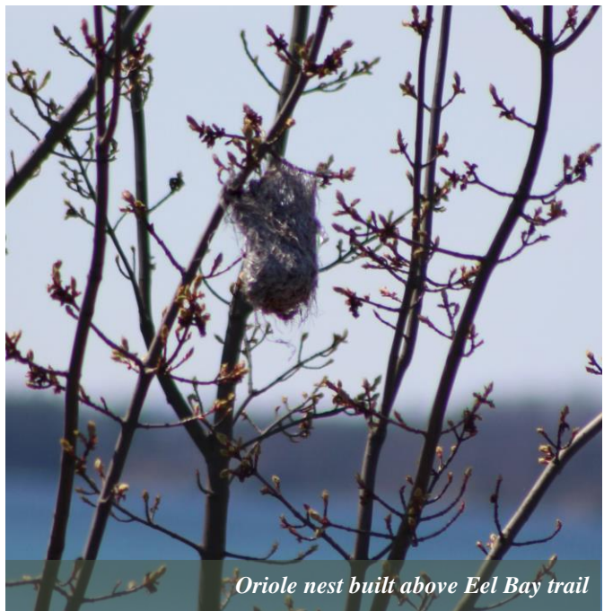
Oriole nest built above Eel Bay trail

Some of the birds show eccentricities in their nest building. The hummingbird and the pewee shingle theirs with gray-green lichens so that they cannot be told from the branch; the great-crowned flycatcher always incorporates a cast-off snake skin into his nest furnishings, why, no one knows...the brown creeper so carefully hides her nest beneath a bit of loose bark that it has seldom been found. ■