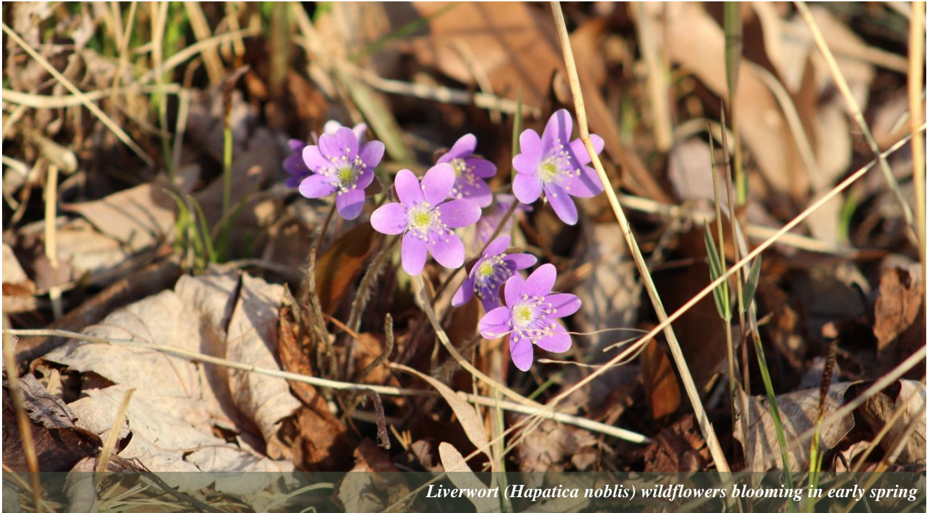
Liverwort (Hapatia noblis) wildflowers blooming in early spring

It has been a pleasure helping the Friends of the Nature Center these past six years. This April I step down from the board of directors after serving two consecutive terms. The Friends' mission is to support environmental education programming that fosters conservation of local ecosystems, encourages outdoor recreation, and inspires our visitors to develop an increased respect for the natural world. Together, we have accomplished much to fulfill this mission and our River community should take great pride in its accomplishments.