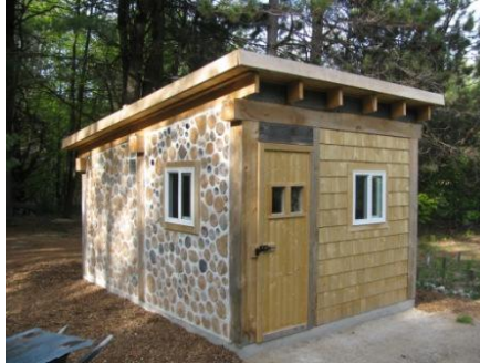
Photo provided by: Cordwood Sauna built in northern New York at Earthwood Building School workshops. www.cordwoodmasonry.com

Instructor: Dan Payne September 13-15 th , 2013