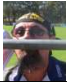
Ado #38905 TM 27