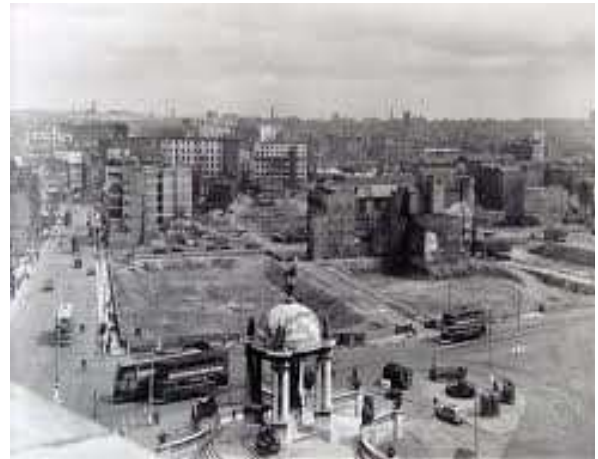
By 1944 the damage was still there to see, but it was much tidied up