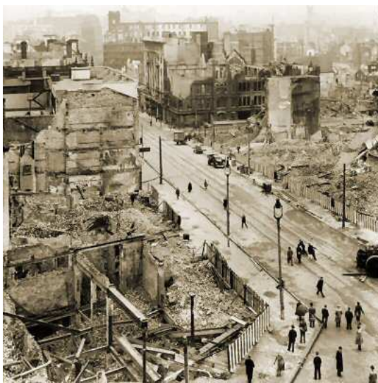
North John Street