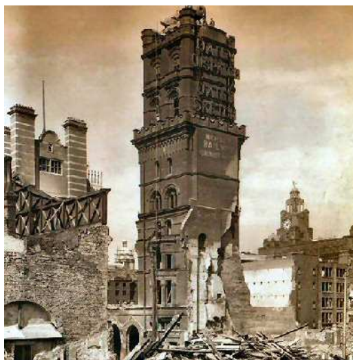
James Street Station

This is at the end of this booklet and gives you a wealth of resources that will help you to do the tasks.