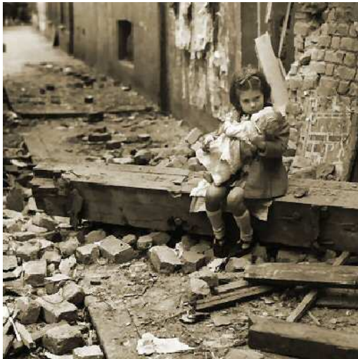
Surrounded by bomb damage