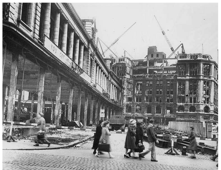
Amidst all the chaos life carried on