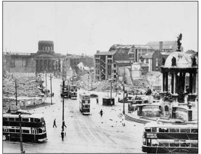
The trams kept on going