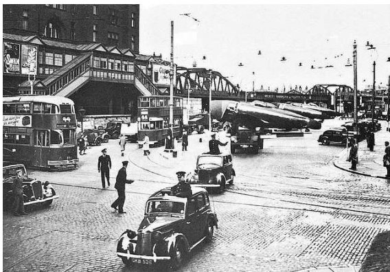
Aircraft at the Pier Head in preparation for D-Day