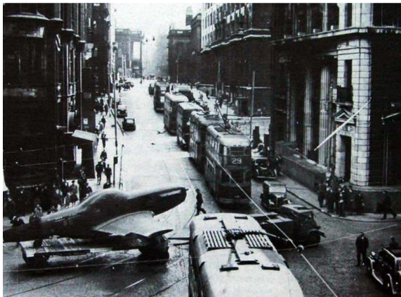
Aircraft in the city centre!