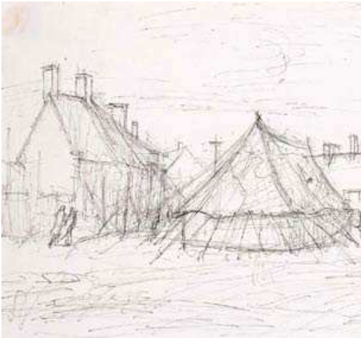
A contemporary sketch showing the mix of houses and tents