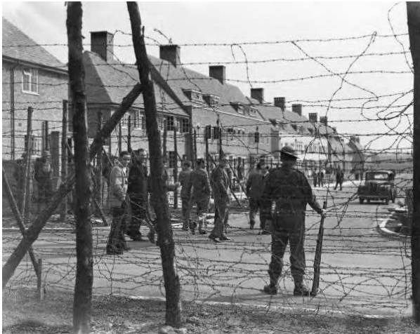
A British soldier on guard duty at Woolfall Heath