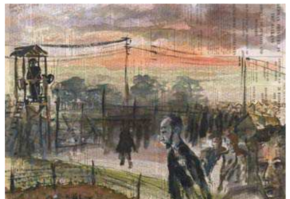
'Empty Days' by Hugo Dachinger