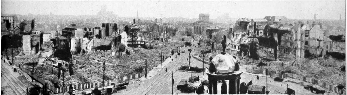
This is the centre of Liverpool in 1941 after eight nights of air raids.