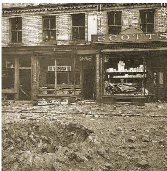
Bomb crater in street

How damaged is the Tardis? Is there a chance of repairing it? Are you going to be allowed to get to it? What are the alternatives? You need to get back to Liverpool, preferable sometime in June 2013.