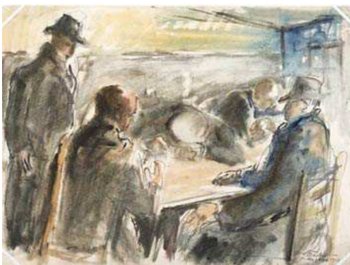
'Waiting, waiting,' by Hugo Dachinger