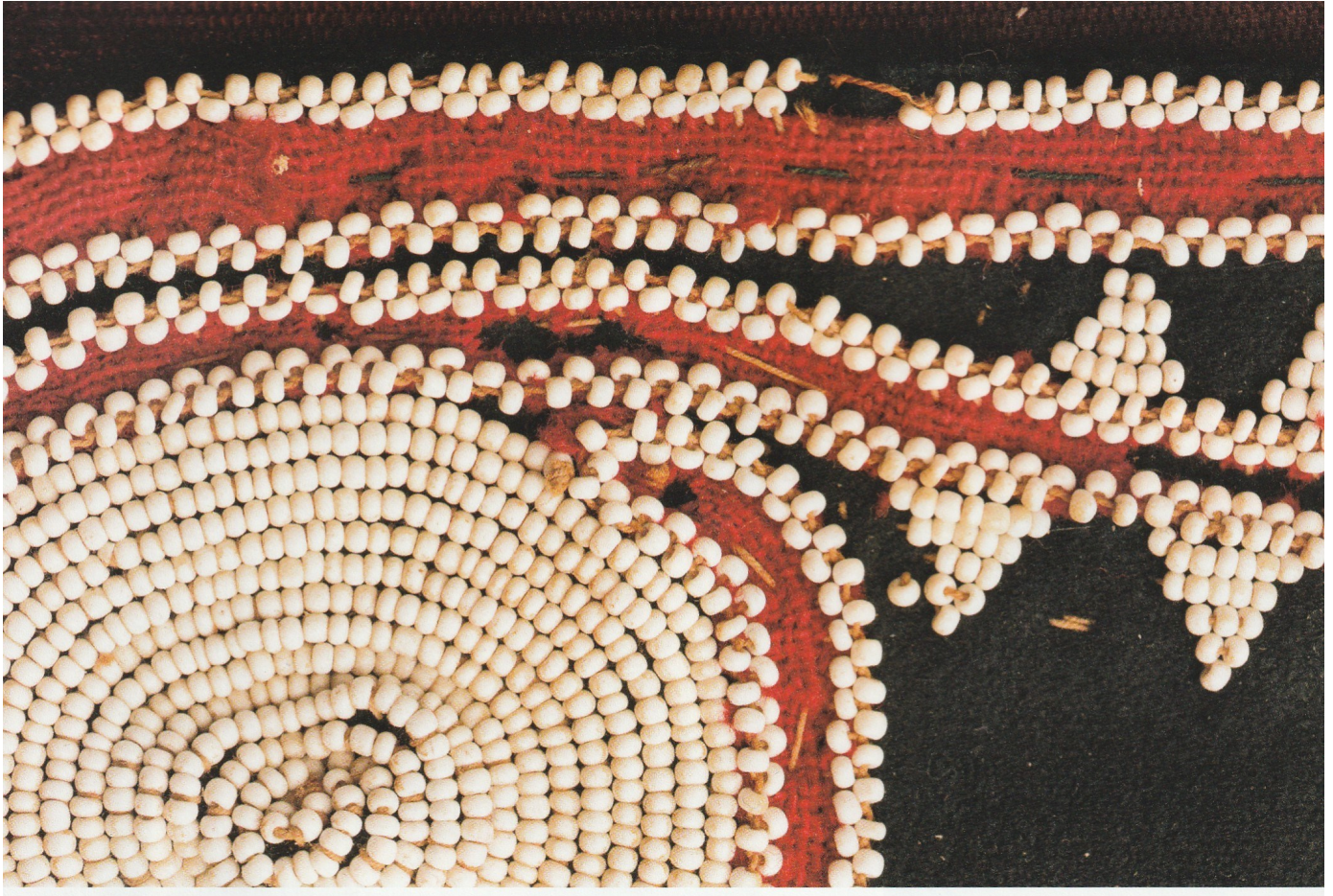
One of the detailed pictures of a period piece of beading in the book.