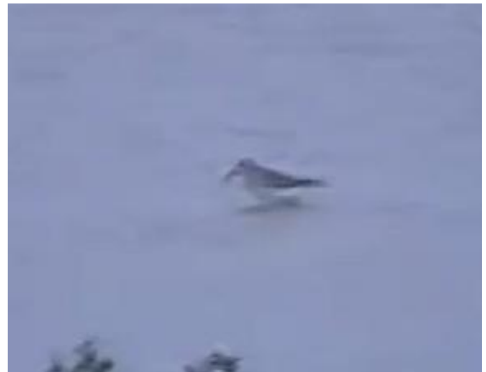
Curlew Sandpiper at Nickolls Quarry (Ian Roberts)

It was first recorded locally on the 17 th September 1957, when Roger Norman found one at Nickolls Quarry, but over thirty years elapsed until the next sighting in 1988, when Ian Roberts saw three flying east past Mill Point on the 2 nd August.