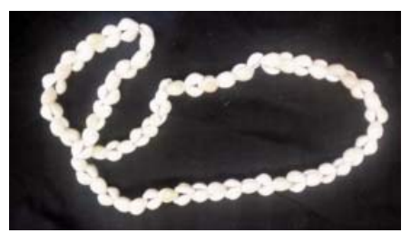
A necklace made from Monetaria moneta .

Think of our current money, especially our coins—they are durable, convenient, recognizable, small, easy to transport and difficult to replicate. The money cowry fits all these descriptions and was available to societies long before machines were available to stamp out coins.