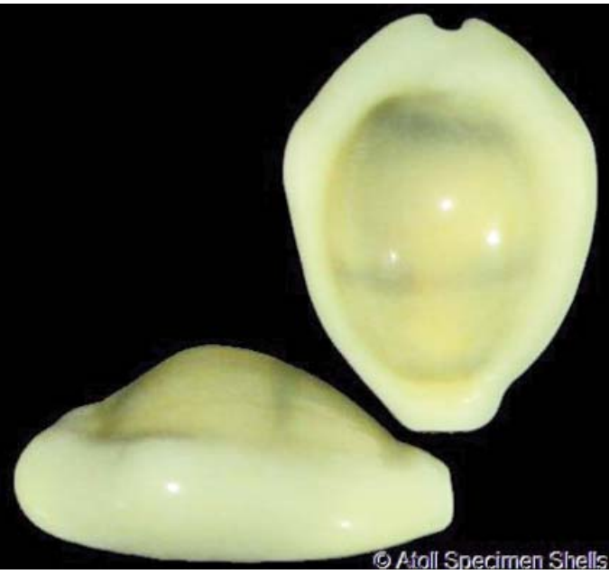
the Monetaria moneta (Linnaeus, 1758).