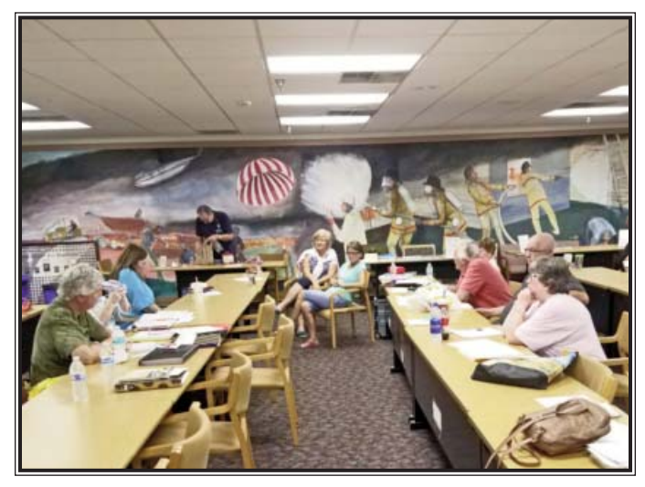
Shell Show Committee Meeting