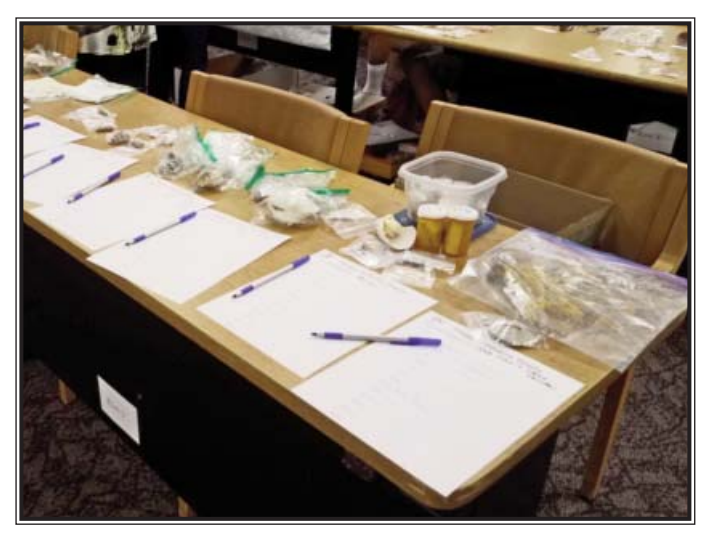
The silent auction