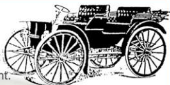
INTERNATIONAL AUTO BUGGY

NO, we did not supply the original gasket for this one, but if called upon we could produce a satisfactory replacement.