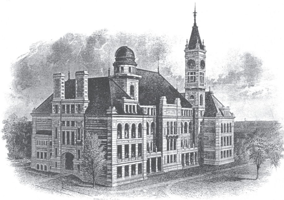
B. M. C. Durfee High School, Fall River, Mass. DEDICATED JUNE 15, 1887

Raise our praises high to Durfee, Alma Mater dear. Tow'ring high beside the river, Radiant beacon clear.