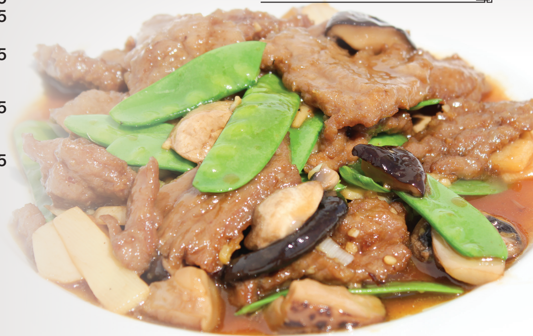
Beef w. Mushrooms and Bamboo Shoots