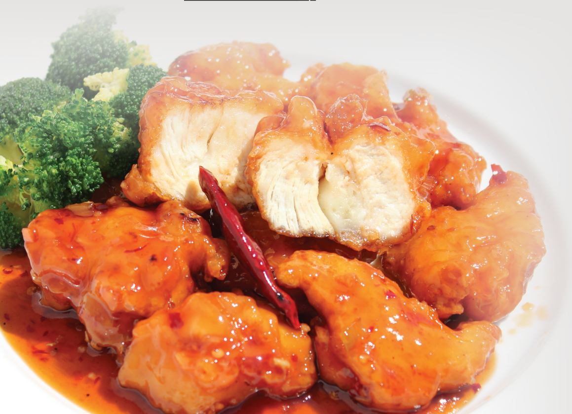
General Tso's Chicken