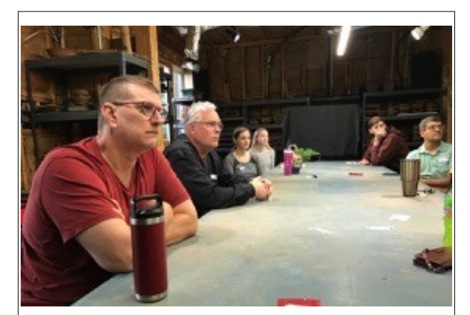
The other half plus a couple of mentors.