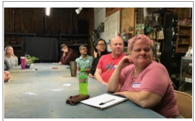
Half the 101 students.