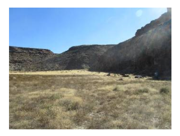
The White River Narrows

The largest sites are site 4 and site 7.