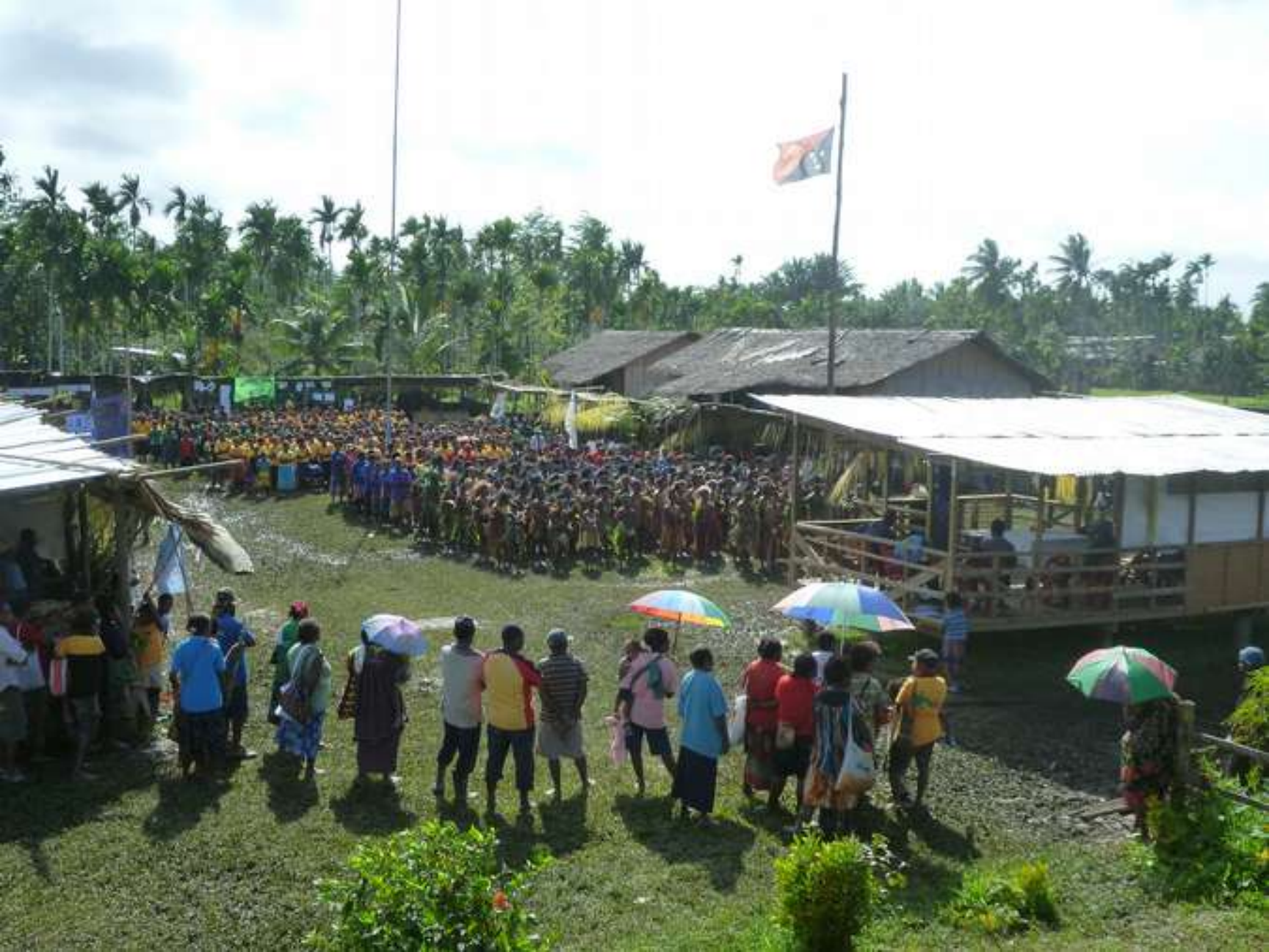
Koravake, Gulf Province. 500 students, 11 schools. Not many VIPs.