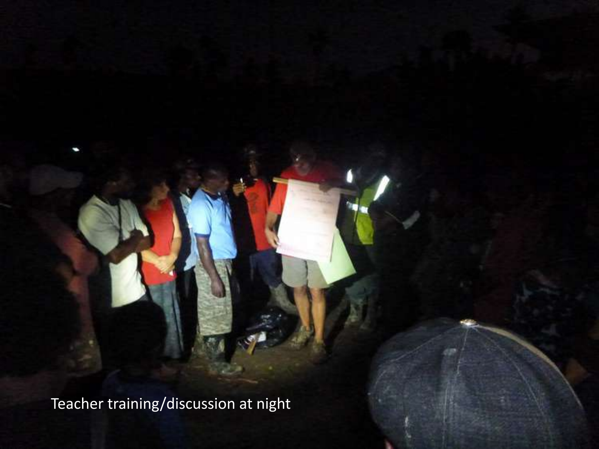
Teacher training/discussion at night