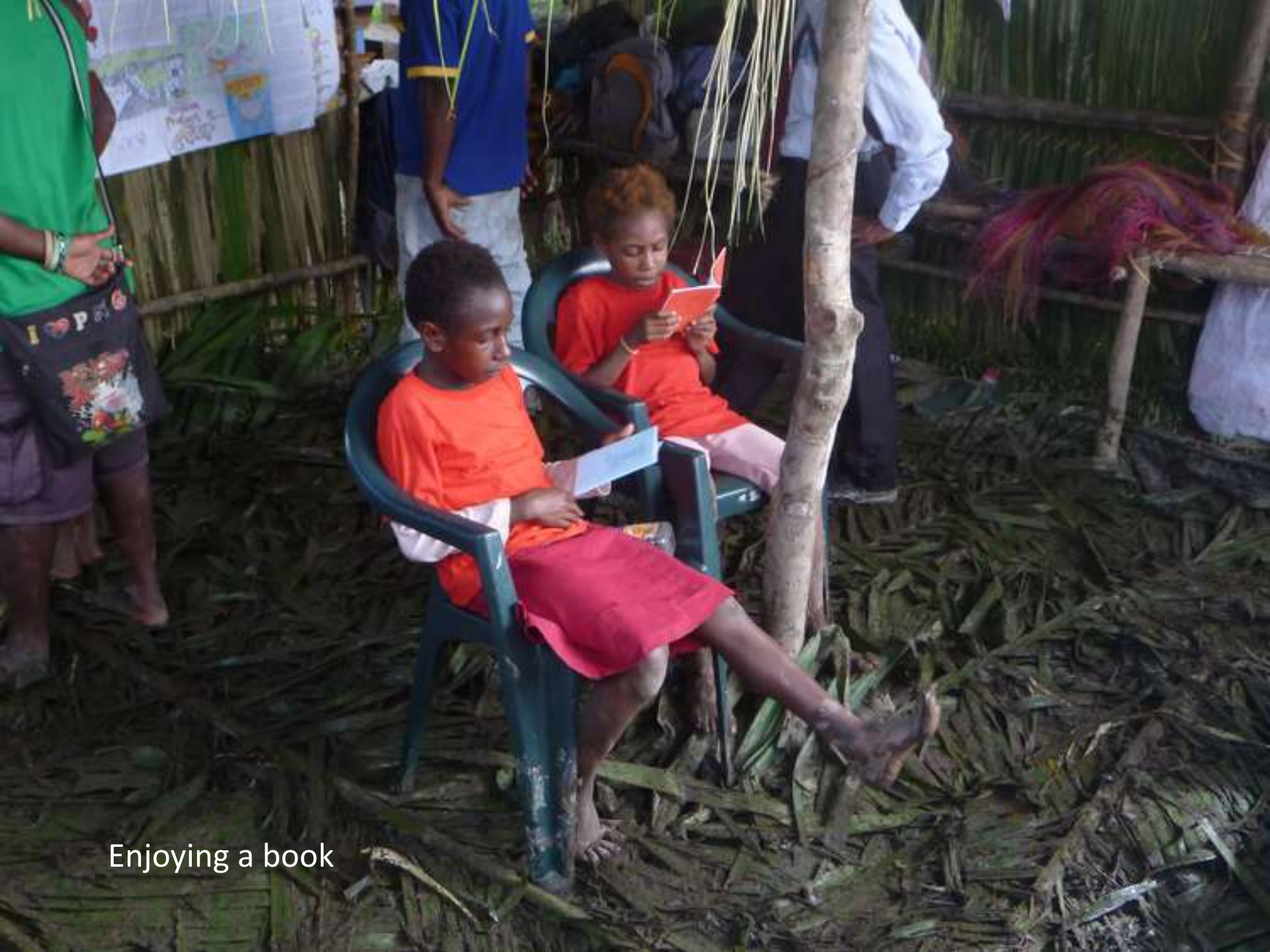
Enjoying a book