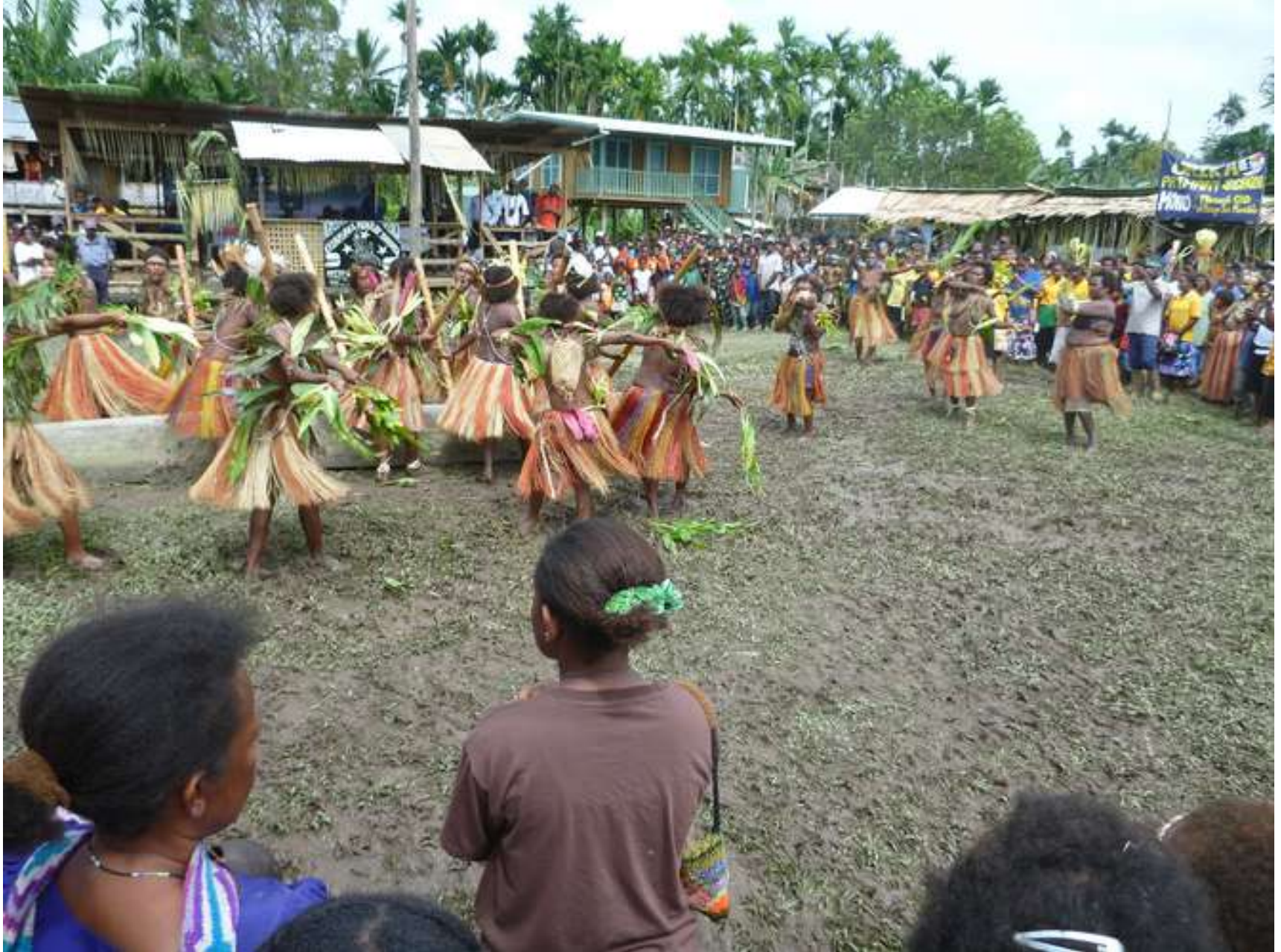
Big focus on cultural items at first ...