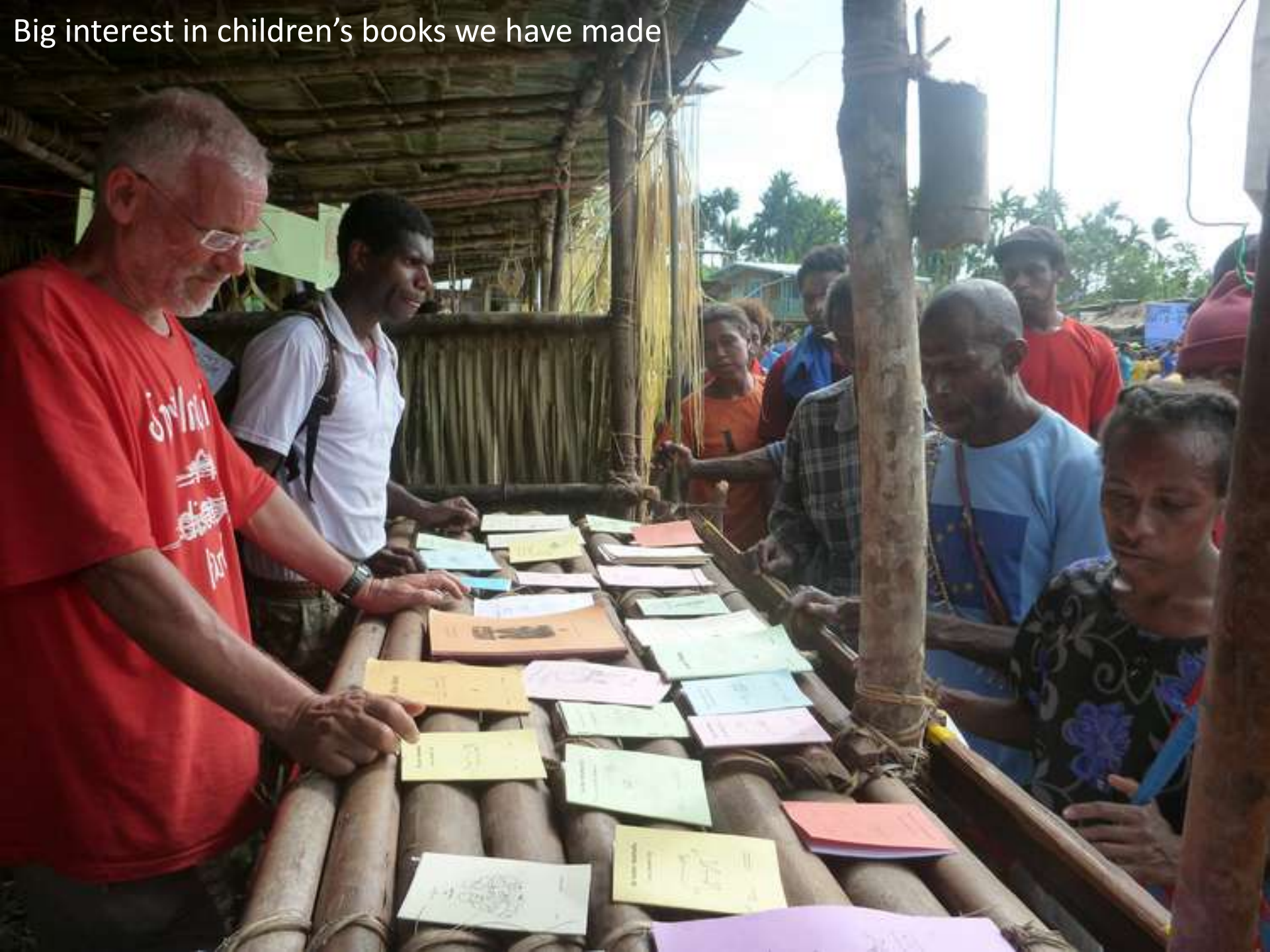
Big interest in children's books we have made