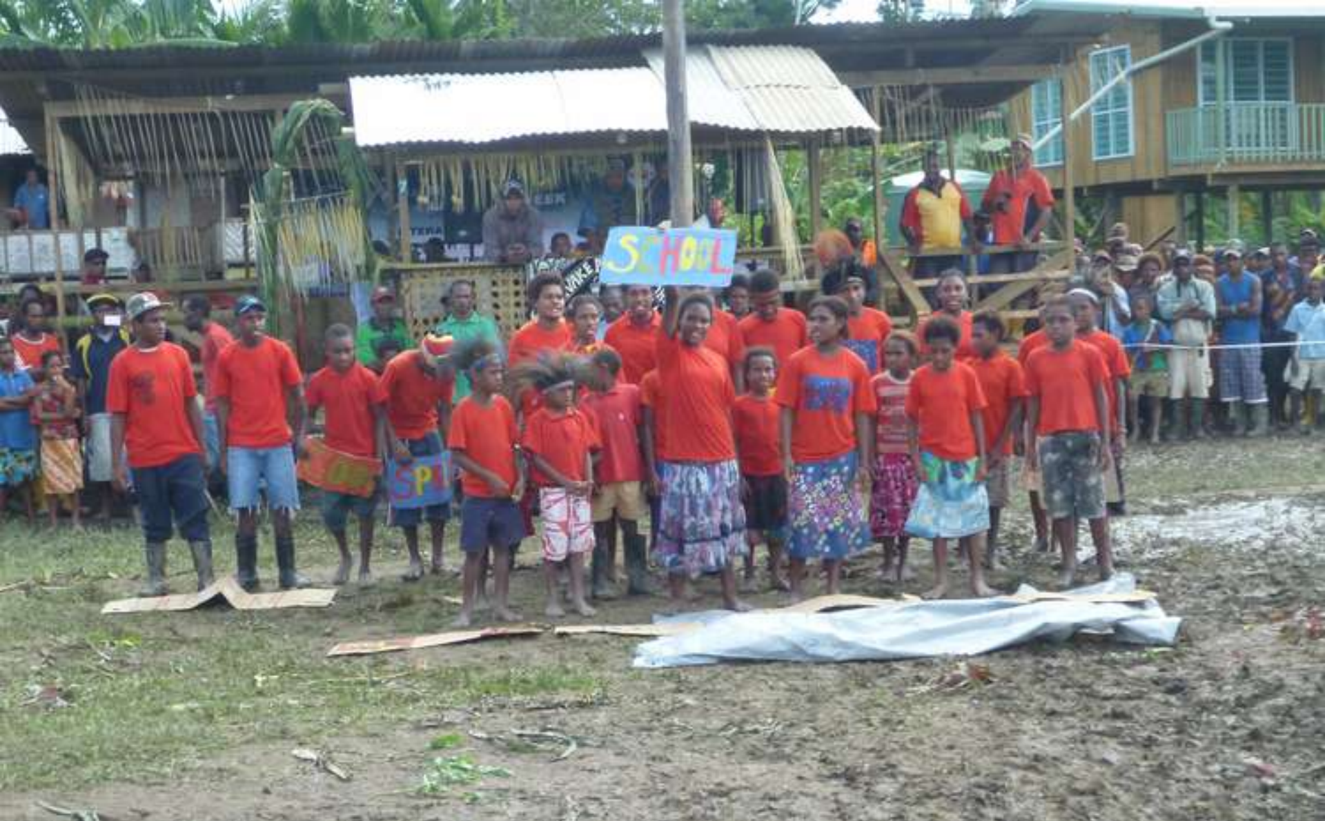
literacy song 'School is really cool'