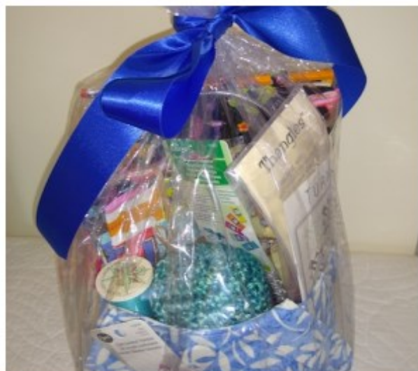
April Octoberfest Day Basket

to every meeting. We want to get to know the name as well as the face! Those not wearing their name badges will be fined 50 cents .