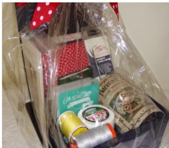
April Octoberfest Night Basket

We have 2 more wonderful baskets of quilting goodies to raffle off at the April PPQG meetings.