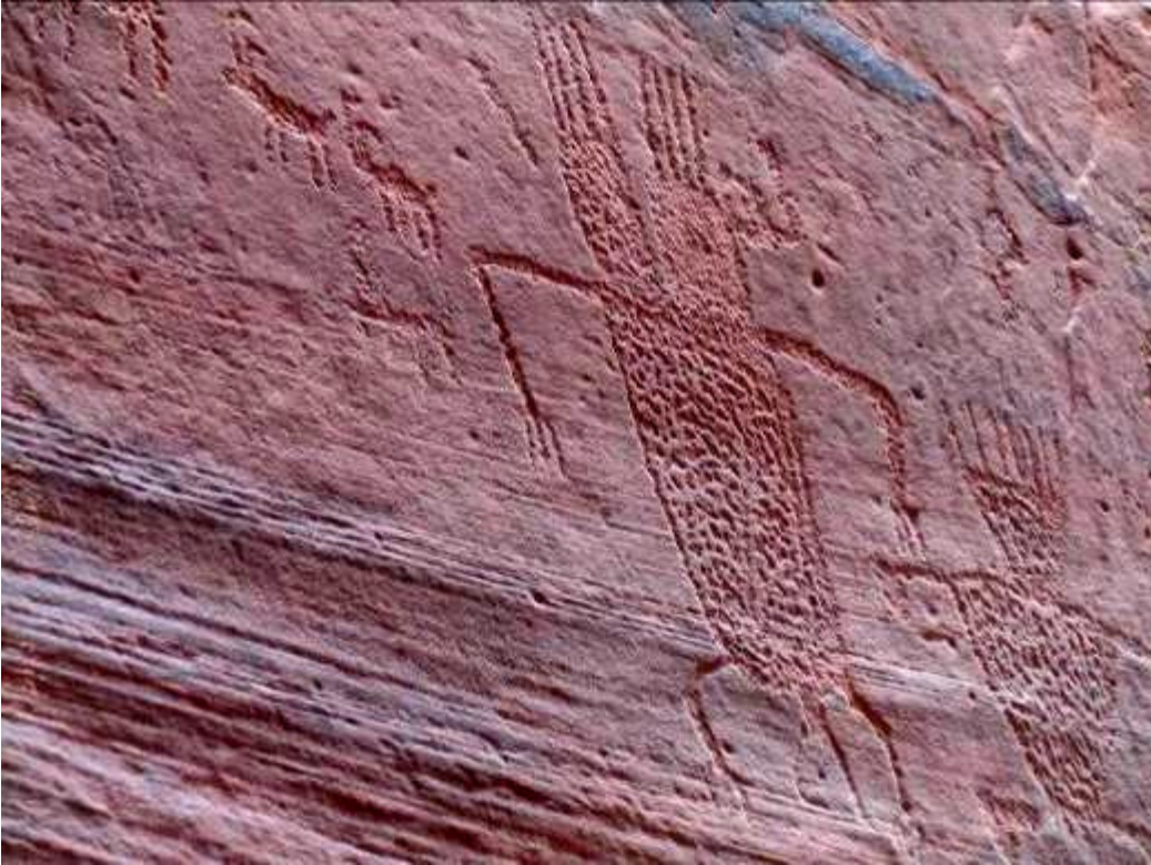
Figure 4 – the large 2-headed anthro from a side view