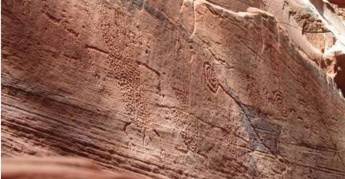
Figure 2 – The panel from the left

The panel shows (from the left) a couple of sheep and the a large 2-headed anthro with a trapezoidal shaped body (Figure 4 and 5), a medium sized anthro with a trapezoidal head and body (Figure 6) and a small sized anthro with a trapezoidal shaped head and body (Figure 7). All three have head dresses and all three appear to be holding hands. They all have three fingers and toes.