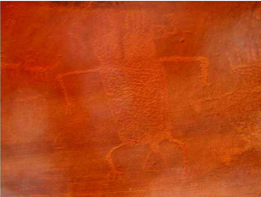
Figure 5 – the large 2-headed anthro from a front view