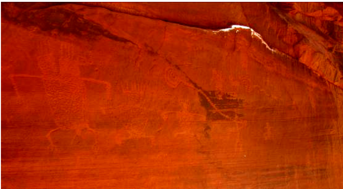
Figure 2a – The panel from the front