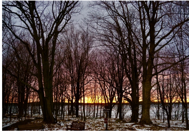
Sunset viewed over Eel Bay