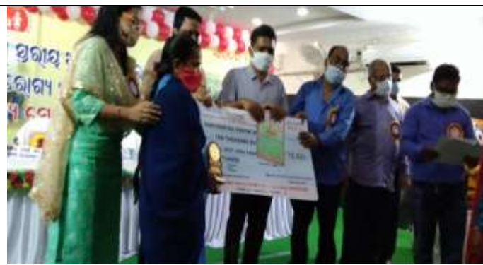
The model village, Gudang Gorjang of Gumma block was recognised as the best GKS village of the block for the year 2020-21 by The District Collector, Gajapati and awarded with Rs. 10,000/-. The award was received by the village representatives of the village. This is also a great achievement of PREM.