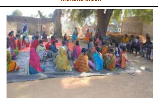
Community awaness meeting to stop child marriage in Gajapati district