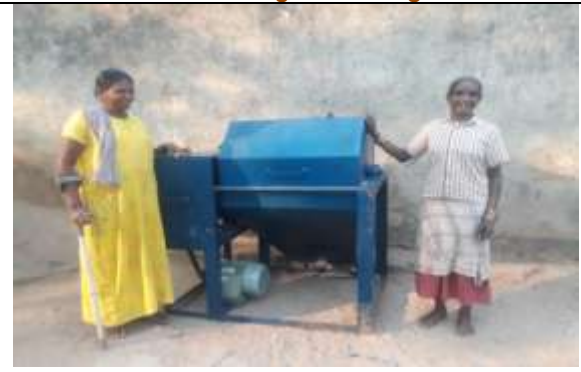
Turmeric processing unit has been established at Gudang gorjang model village