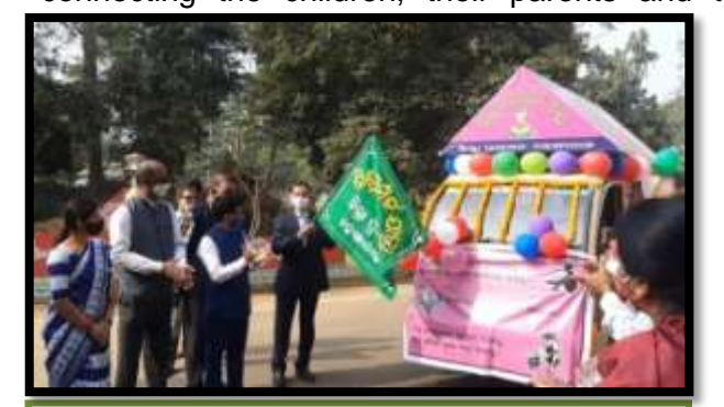
Shishu Sampark Ratha (Chariot) was crafted with Flex, Posters on girl children's issues, Songs and audio messages on children

Odisha State Commission for Protection of Child Rights (OSCPCR) visualising the imperative need of connecting the children, their parents and the larger communities in the post COVID period