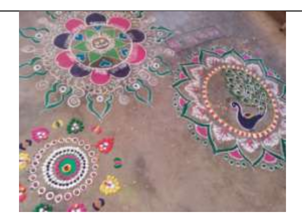
Rangoli competition organised for the Adolescnce girls on Nationl Girl Child Day