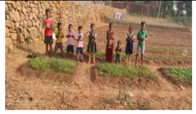
Organic vegetable kitchen garden developed at Gudang Gorjang model village where small kids participated actively in this process