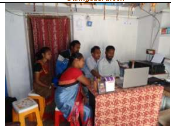
Team meeting at Gumma cluster regarding development of business plan