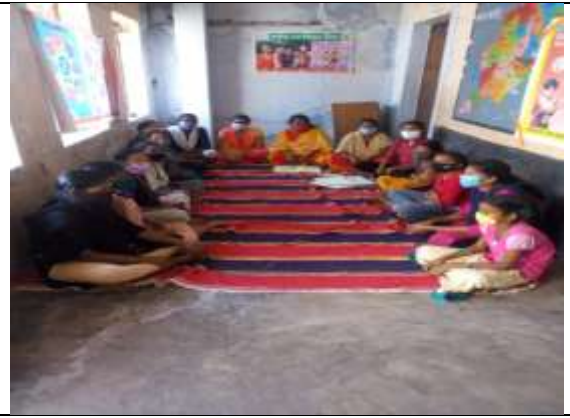
Adwika meeting organised at village level at AWC of Mohana block