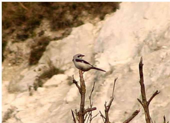
Great Grey Shrike at Samphire Hoe (Dale Gibson)

It is a scarce but increasing passage migrant and winter visitor in Britain, with a recent average of over 200 sightings per annum (White & Kehoe, 2020). It is a scarce autumn migrant and winter visitor in Kent (KOS, 2020).