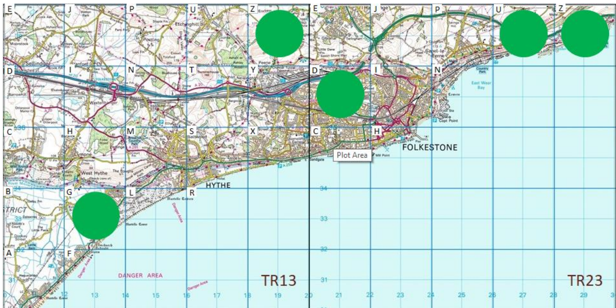
Figure 3: Distribution of all Great Grey Shrike records at Folkestone and Hythe by tetrad

Figure 3 shows the distribution of records by tetrad.