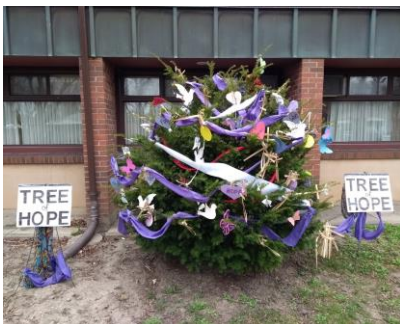
The Tree of Hope

The gift that comes with the Spirit at Pentecost, is despite many languages speaking at the same time, there is clarity and discernment. The only way we can be attentive to God's mission is through listening to many voices and especially those who differ. I have discovered through years of ministry, that it is often the small, single voice that resonates more with the spirit than the majority. I actually stopped using majority rules at parish council and vestry. By listening to each other, decisions were made by consensus and when we moved the church, no one was left behind.