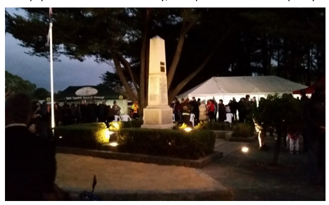
The Tyabb community enjoying a Gunfire Breakfast