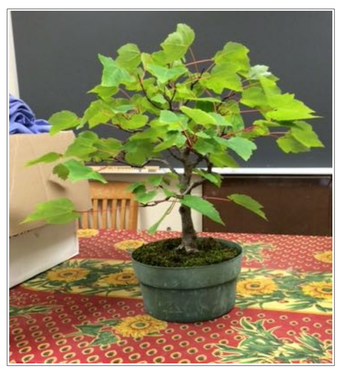
One of Art's Red Maples in training