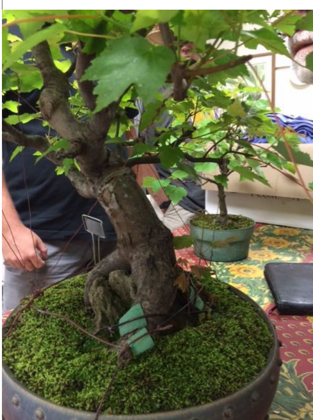
Time and plenty of wire are required to achieve good bonsai