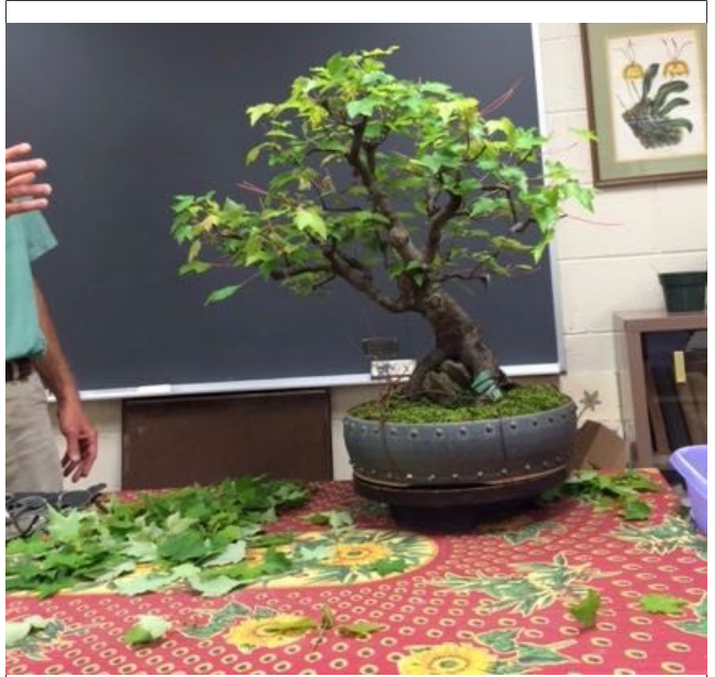
As most of you know, by the end of the session, most of the tree will be on the floor or table, on the way to a better bonsai!