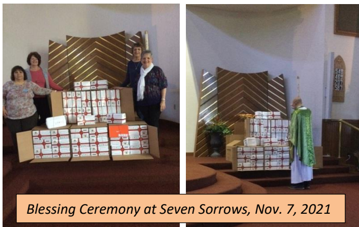
Blessing Ceremony at Seven Sorrows, Nov. 7, 2021