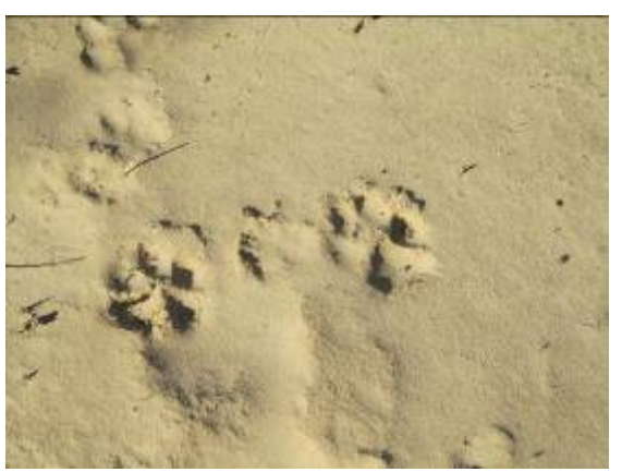
Cat tracks – Lion?

The January field trip was to the "Winter Quarters" site above Snow Canyon. About 25 members participated in the hike on a perfect day.