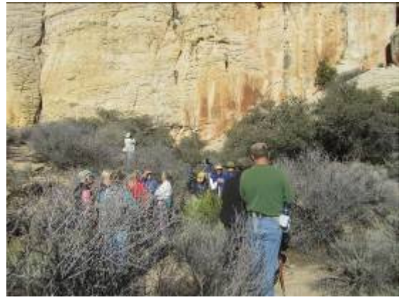
Lot's of discussion