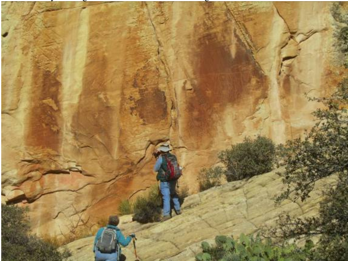
The long trek back