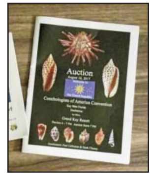
Figure 8. The oral auction catalog.

The welcome party was held outside on the hotel's verandah where attendees were treated to many Caribbean foods including conch fritters and the hotel's famous chocolate cookies. The 90 degree ambience eventually forced many inside to complete the evening. There was even a silent auction inside and many came away with a prized shell.