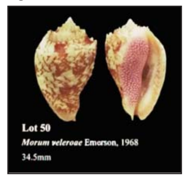
Figure 9. The Morum veleroae.

The oral auction was most entertaining. Figure 8 Approximately 120 lots of specimen shells were offered and there seemed no end to the amount of spending involved. The mollusks were all from the Frederic Weiss Collection (Frederic Weiss 1929-2015) and were outstanding. The most exciting bid action was for a