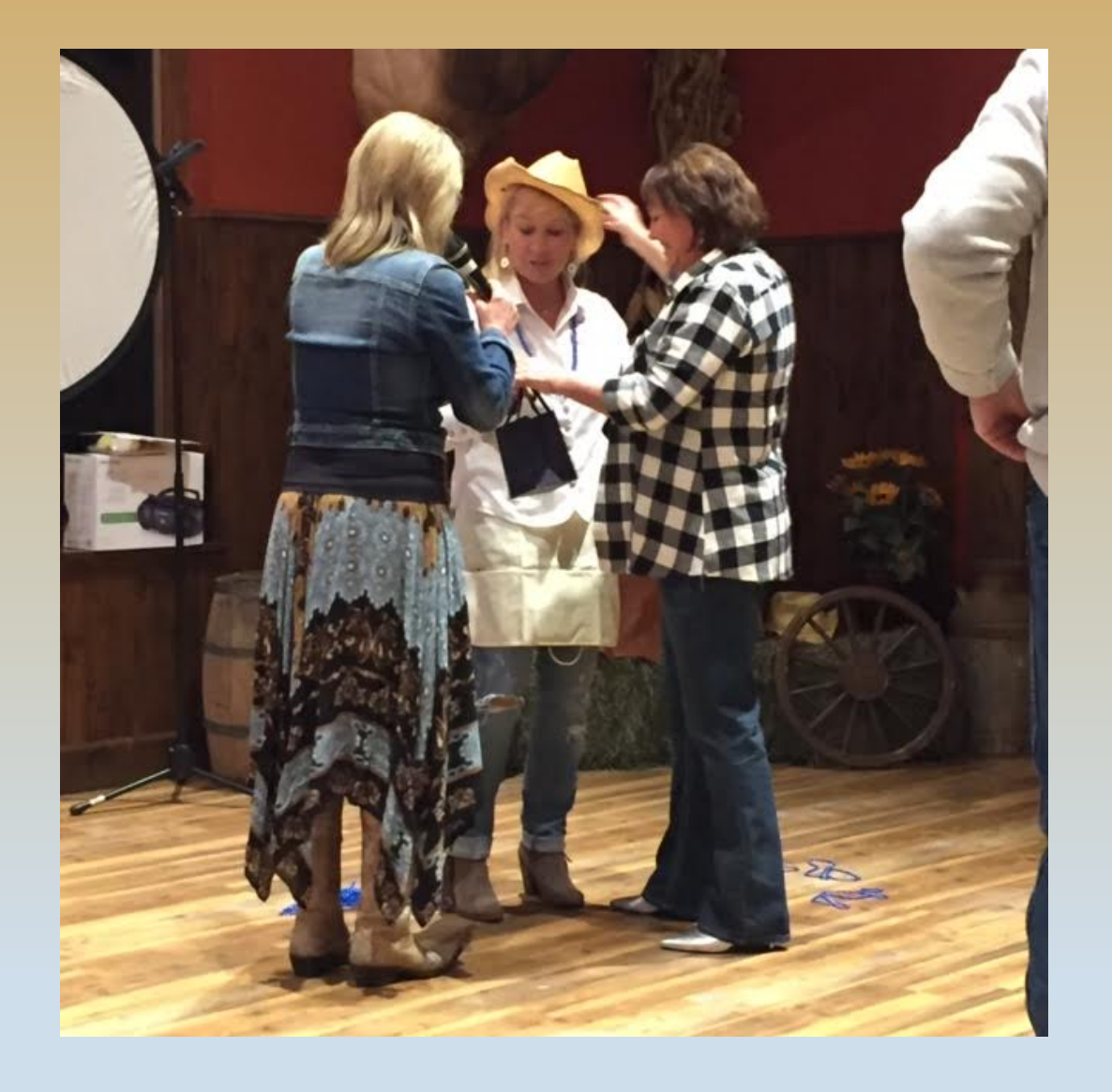
Winner of the D. Copperfield Jewelers $500.00 Gift Card...Congrats!