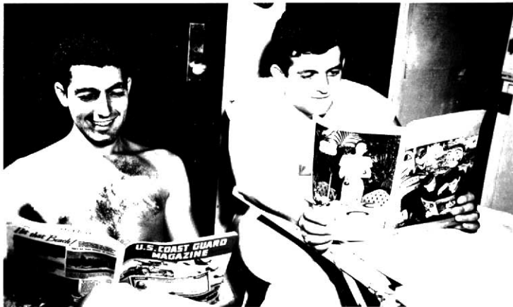
A couple of unidentified Coasties catch up on Coast Guard news during WWII, courtesy of U.S. Coast Guard Magazine.

Please! Look at the Exp. Date on your label and renew if due. The Quarterdeck Log