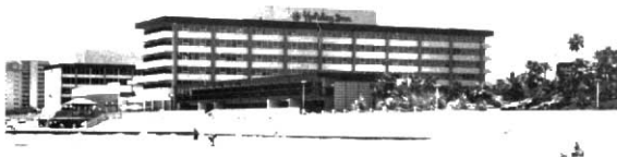
The Holiday Inn Emerald Beach Hotel in beautiful Corpus Christi — home base for the 1998 CGCVA Reunion & Convention, November 4-8.

trip will be a great opportunity to enjoy some outstanding shopping across the border from old Laredo. Also, don't miss the chance to visit the Columbus fleet...full-size replicas of the Nina, Pinta and Santa Maria. Tours start on Nov. 5th with a visit to the USCG Air Station at Corpus