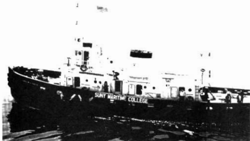
Look familiar? It's the former USCGC Mahoning (WYT-91), now the General Phillip Schuyler, a training vessel for the State University of New York Maritime College at Fort Schuyler, N.Y., since 1985. Launched and commissioned in 1939, it has seen continuous service since then.