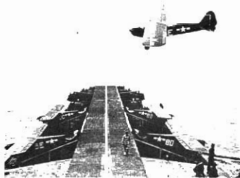
LST Becomes Aircraft Carrier. Crewmen aboard the LST-906 saw their ship converted into a baby aircraft carrier. Its 220-foot long, 16-foot wide runway was built in 72 hours while the ship was in Algiers in 1944. The vessel was used as an aircraft carrier for artillery observation cuts like the one flying by which just took off from the ship. Ten of the aircraft are carried aboard the ship (six on the runway and four in cradles). The planes could not land on the runway but had to land on ground instead.