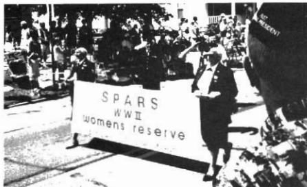
A contingent of Coast Guard SPARS was included in the 1998 Coast Guard parade at the Grand Haven Festival.