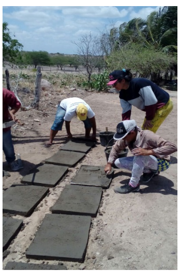
The women and youth learned to make plates to be used on the walls of cisterns.

The major purpose of the current project is to train the women and youth to build cisterns. The objectives are to improve the quality of life through the construction of cisterns to save clean drinking water, to create and strengthen women's groups and help them enter the paid labour market, and to work with women's and youth groups to build community and provide training.