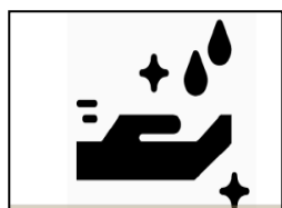
Regular Hand Washing

Please refer to Protocols for Disinfection and Hygiene sport horse activity