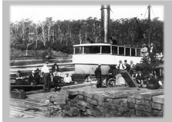
NELLIGEN WHARF 1914