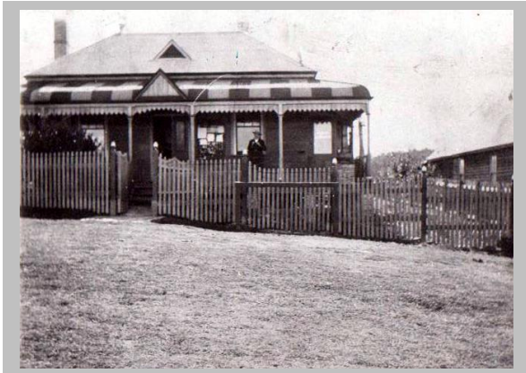
NELLIGEN POST OFFICE 1910