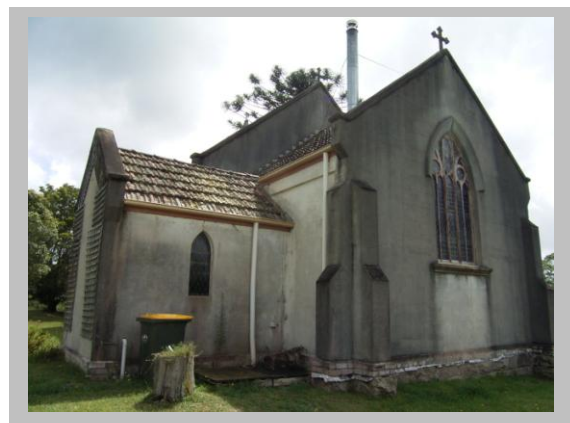
ROMAN CATHOLIC CHURCH NELLIGEN