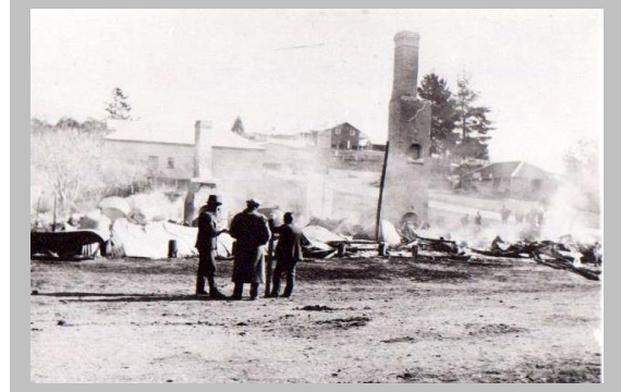
STEAMPACKET HOTEL – THE DAY AFTER IT BURNED DOWN, JUNE 1925