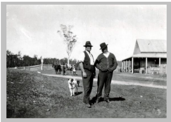
OLD CHEESE FACTORY NELLIGEN