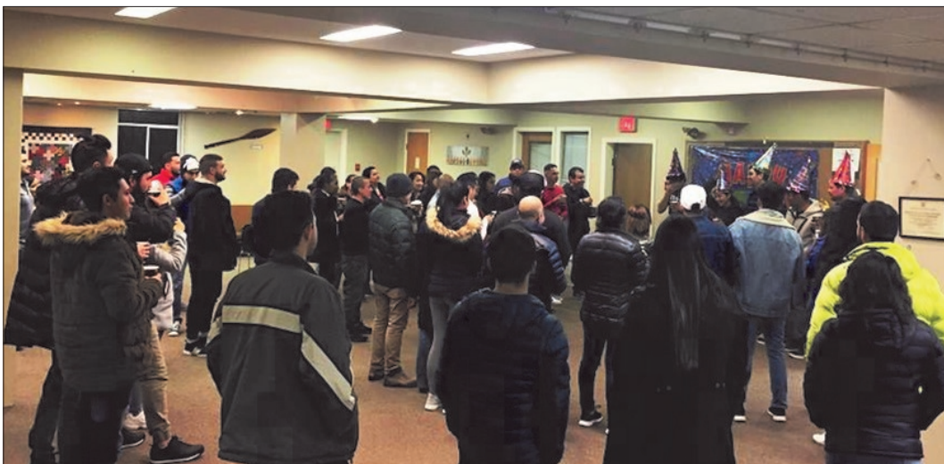
Picture: For the first time we had our January's birthdays in the basement at Peace Church on 52 nd because we wanted to join the group and celebrate together.

The number of students attending Kingcrest International Neighbours (KIN) has been increasing in the last few years and this winter KIN has broken a record with 88 students registered. Due to the high demand of students, we opened two classrooms for English level 1 and also opened a level 5 group. Before, our school usually had one classroom for levels 1, 2, 3 and 4 respectively.