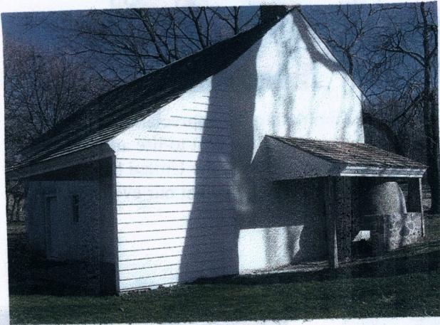
Fourth Quarter December 2006

HALDEMAN MANSION PRESERVATION SOCIETY, INC P. O. BOX 417 BAINBRIDGE, PENNSYLVANIA 17502