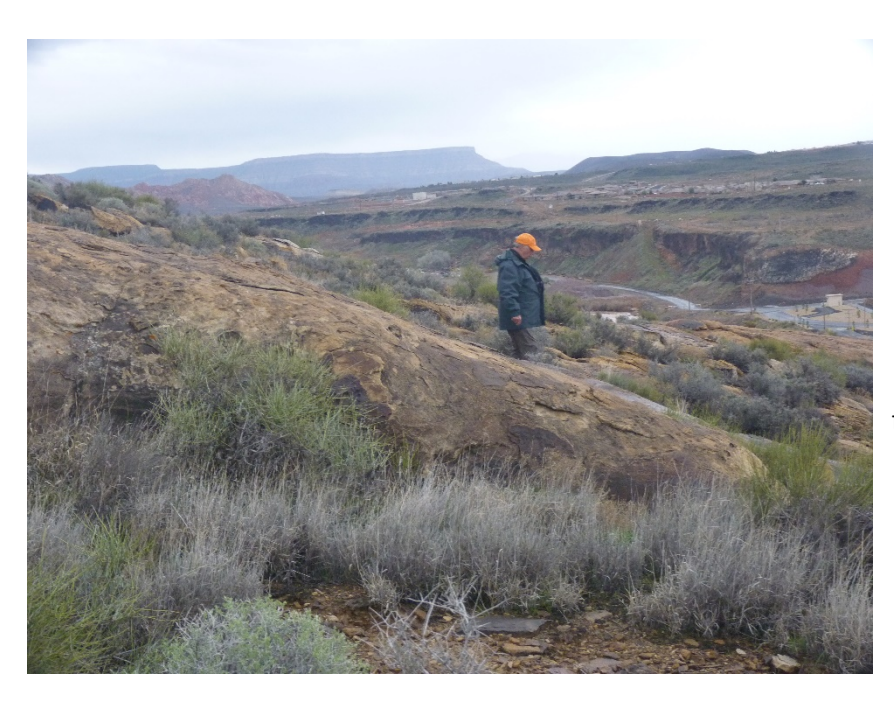
Typical terrain where glyphs were found. Most all were on patinaed rock.