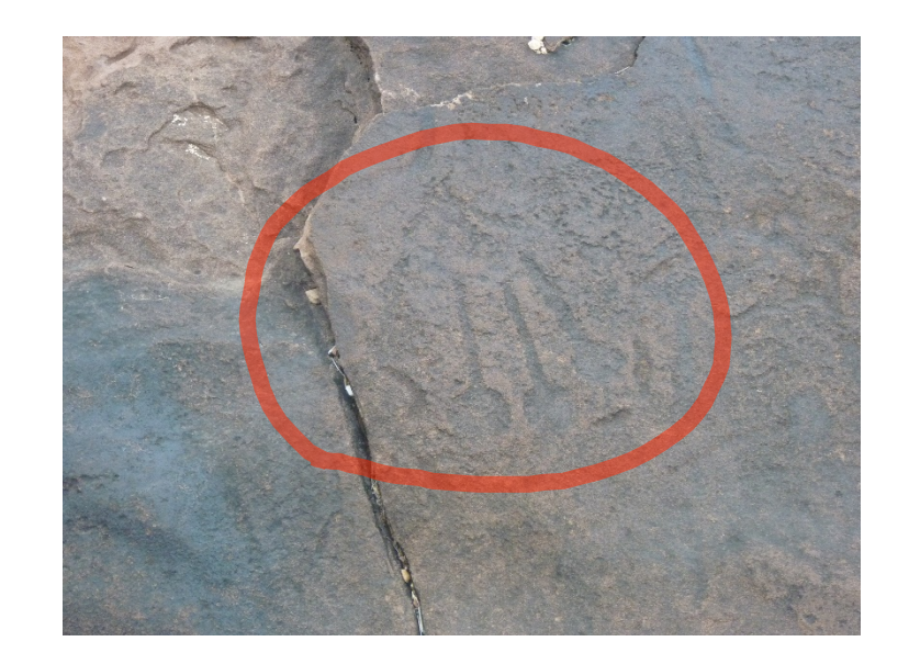
"Strap Clan" Symbol