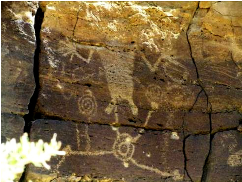
Figure 4 – Close up view of anthro in Figure 3