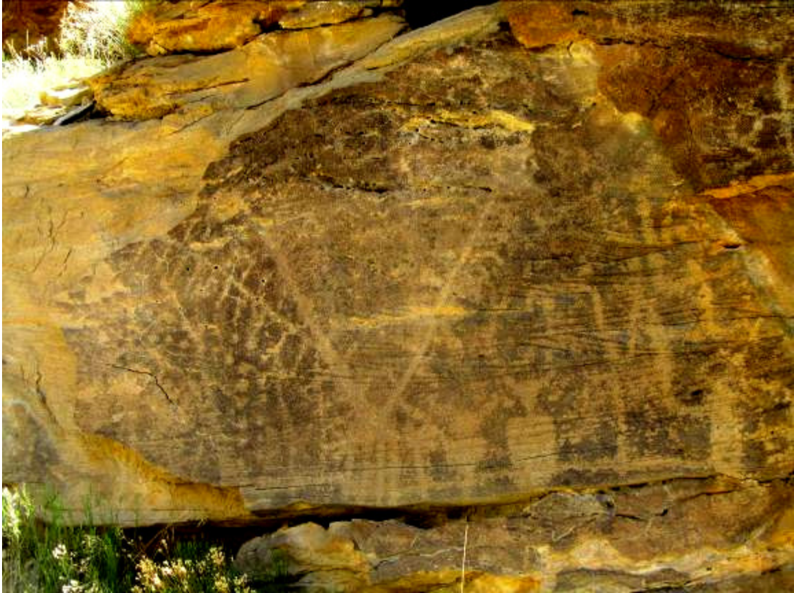
Figure 2 – Close up view of panel in Figure 1

The right side of panel 1 is shown in Figure 3. Here the dominate images are a large anthro with no head and with his hands facing up and with 5 fingers on each hand (Figure 4). To his left is a large spiral with tic marks on the outside diameter of the spiral. Below the anthro is an image of a concentric circle that is in the center of a 3 dot pattern with the dots connected to the circles (Figure 4).