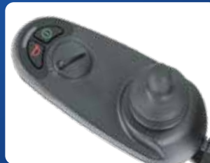
PG GC3 Controller

An experience so superior, it can only be elite. The Jazzy® Elite ES 1 features large, front-drive wheels to absorb the bumps and uneven surfaces of everyday life. The comfortable, high-back seat gives you the support you need all day, every day.