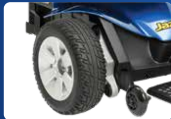
Front-wheel drive design