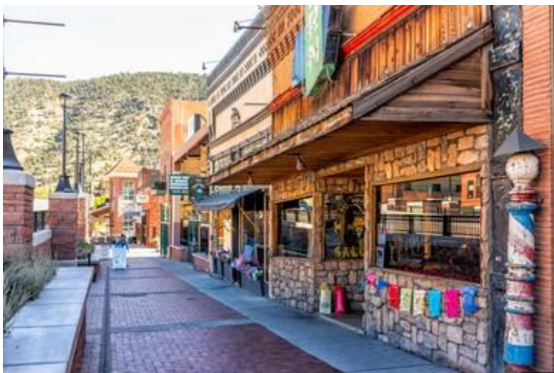
Doc Holiday Saloon