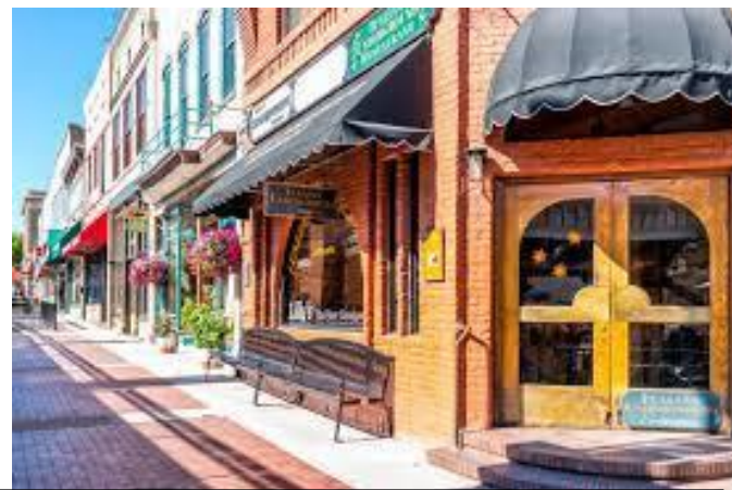
Doc Holiday Museum and Western Clothing Store

I don't recall any of our group purchasing anything inside, but it was certainly fun to look.