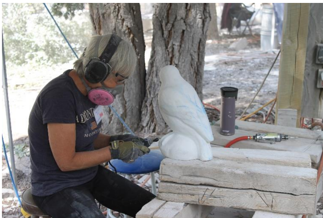
We were fortunate to be able to see the artists at work.