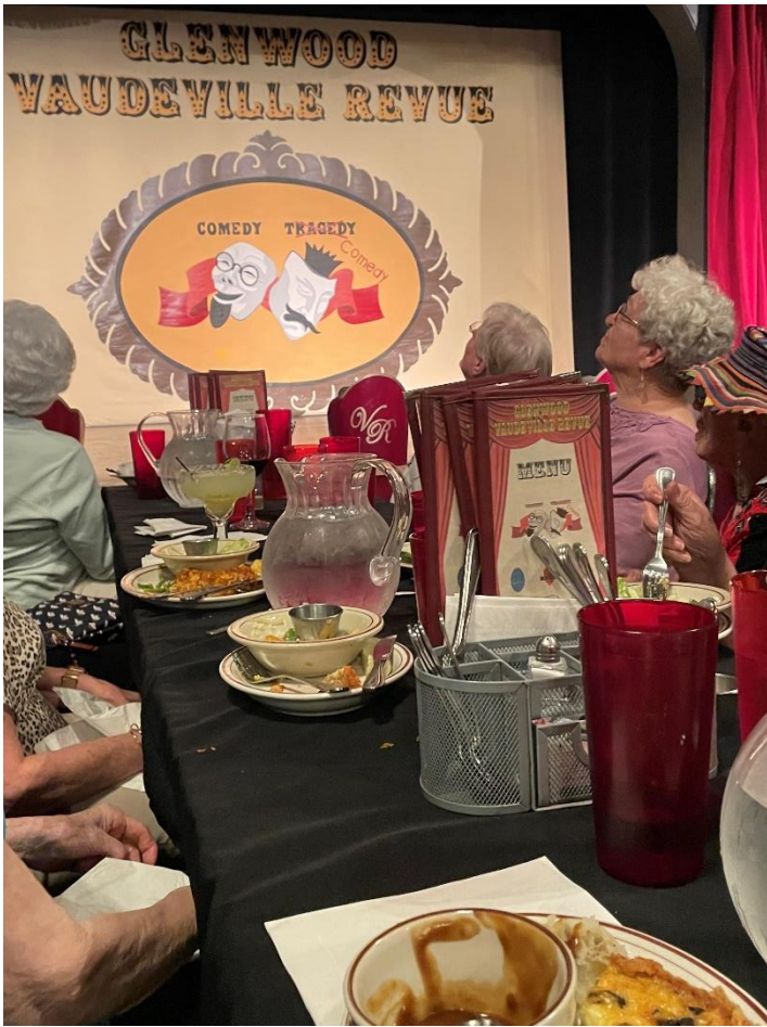
As we were finishing eating, the “pre-show warmup” began with songs, jokes and gag skits.