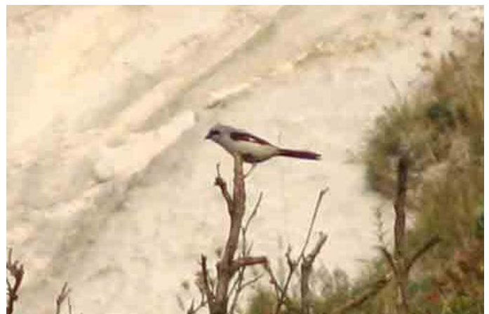
Great Grey Shrike at Samphire Hoe (Dale Gibson)