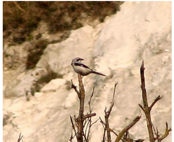
Great Grey Shrike at Samphire Hoe

It is a scarce autumn migrant and winter visitor to the county.