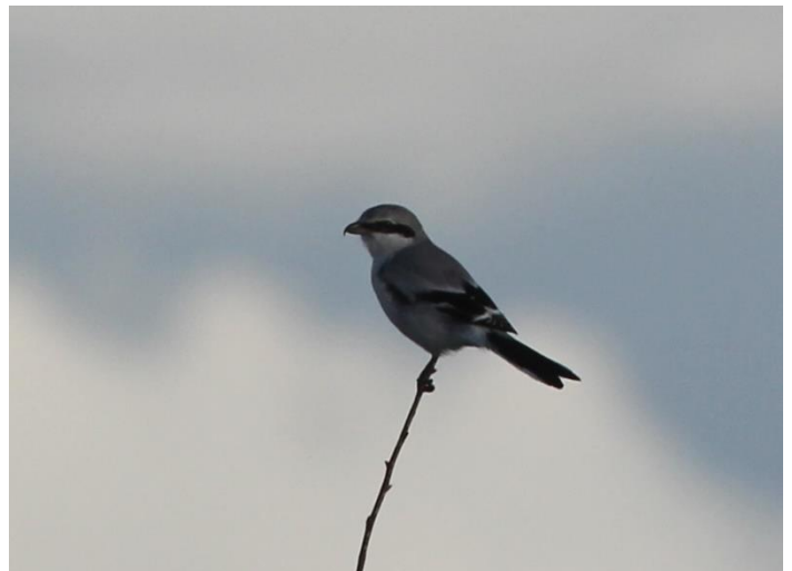
Great Grey Shrike at Abbotscliffe (Ian Roberts)