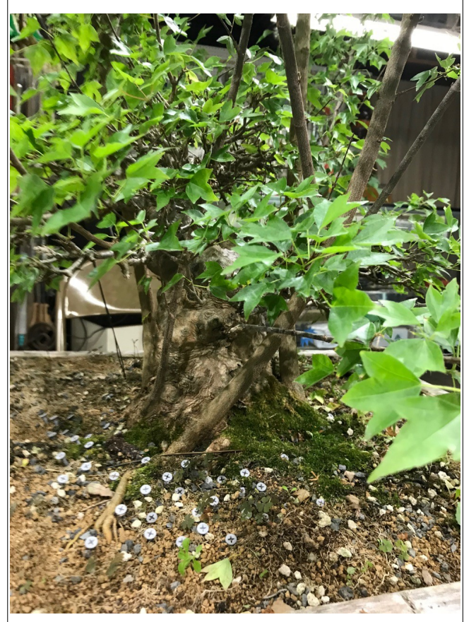
Roots arranged and held in place with screws on wooden shelf.

asked about the many screws where roots normally would be. Danny explained that the tree was planted on a board and the roots arranged and held in place by the screws. The board was placed on and covered with bonsai soil. When the tree is placed into a shallow bonsai pot, the roots will be ready.