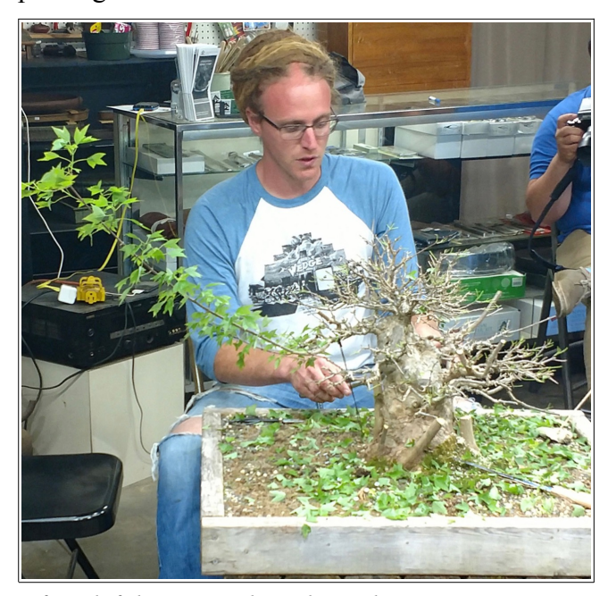
After defoliation.