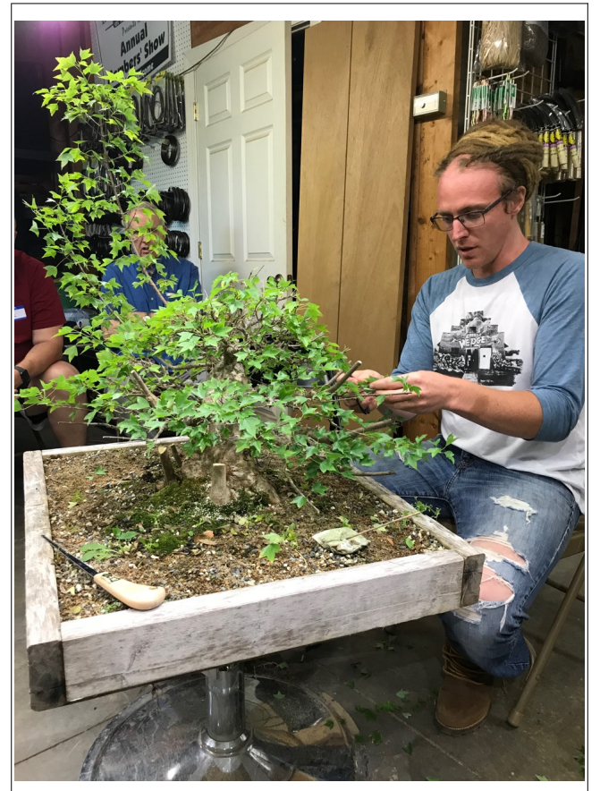
The bonsai is slowly revealed.