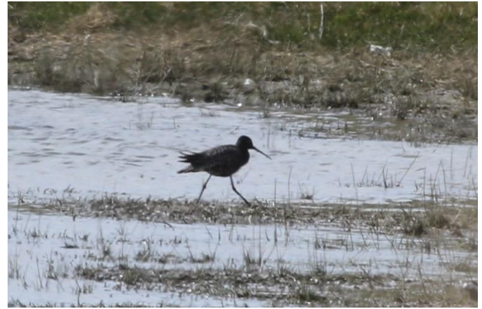
Spotted Redshank at Donkey Street (Ian Roberts)

Breeds in subarctic tundra across northern Europe and across northern Siberia almost to the extreme east. Winters from western Europe and West Africa to south-east China. European migration is characterised by long, continuous flights between staging areas, so that over large regions it is seen only in small numbers.