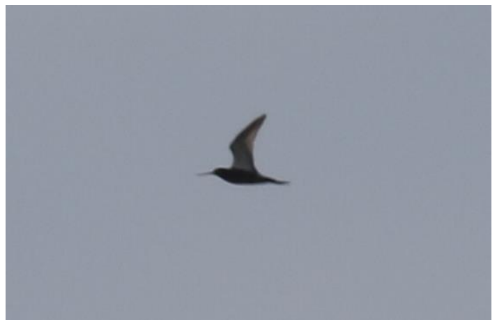
Spotted Redshank at Donkey Street