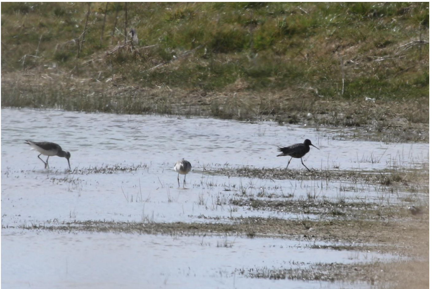
Spotted Redshank with Greenshank at Donkey Street