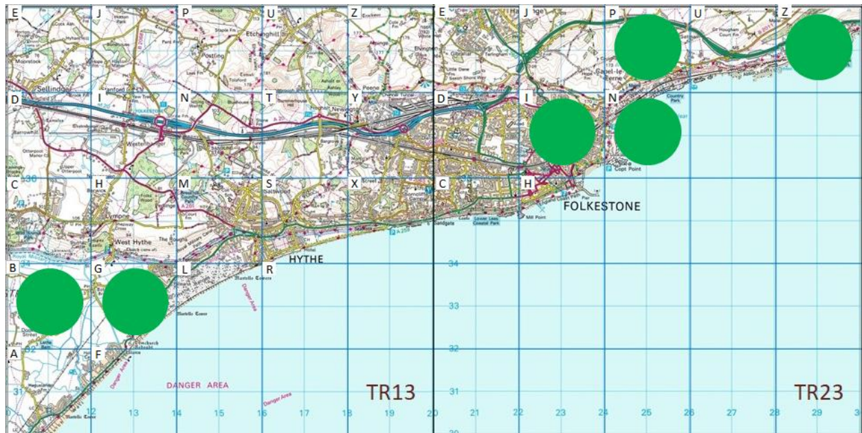
Figure 3: Distribution of all Spotted Redshank records at Folkestone and Hythe by tetrad

Figure 3 shows the distribution of records by tetrad. Although there have been no records at the site since 2006, Nickolls Quarry still accounts for 77% of the total occurrences.