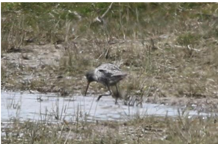
Spotted Redshank at Donkey Street

It has been particularly rare since, with just two subsequent sightings: one reported on the western beach at Samphire Hoe on the 30 th August 2010 and one with four Greenshank at Donkey Street on the 25 th to 26 th April 2021.