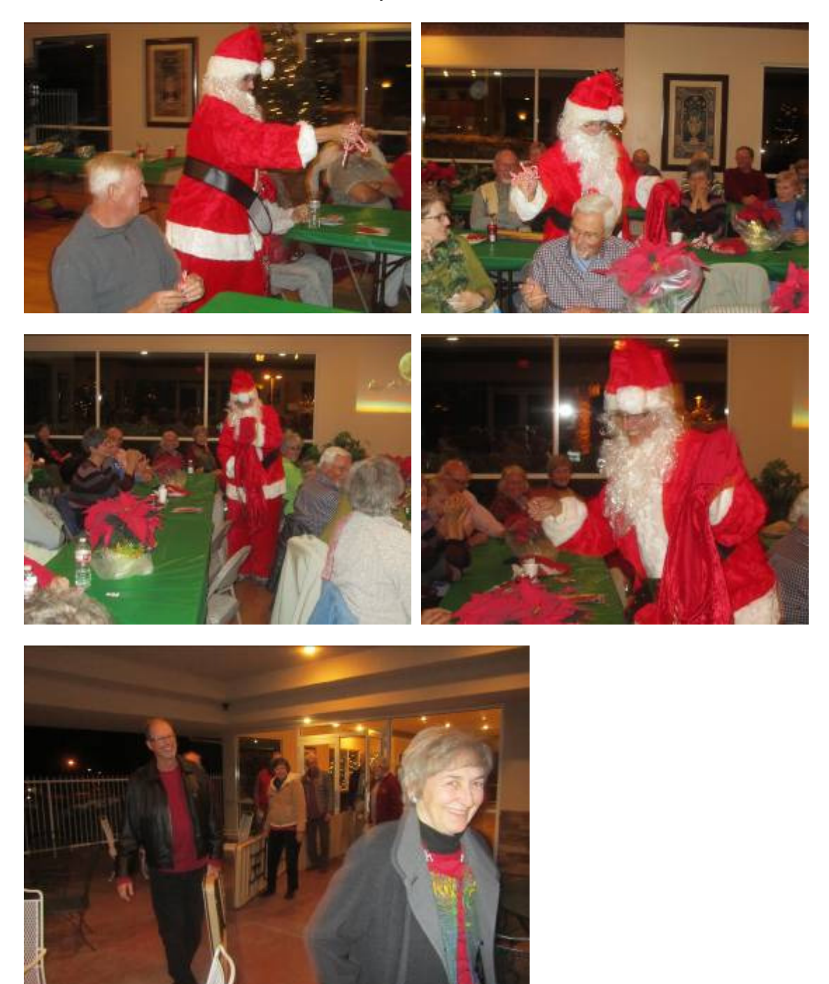
Everyone had a smile on their face as they helped clean up the hall.