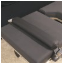
DSC-DV12 DaVinci ® Gel Restraining Bump 21"L x 2.5"H w/ Gel Bump (Includes Integral Gel Pad)