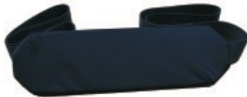
BD800-PAD/BD800L-PAD/BD800XL-PAD Same as BD800 w/ Padded Memory Foam Mid Panel BD800-PAD: 96" BD800L-PAD: 120" BD800XL-PAD: 132"