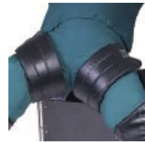
DSC-NTS-B Bariatric Thigh Retractors (Nissen Style) Pair