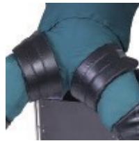
DSC-NTS Thigh Retractors (Nissen Style) Pair