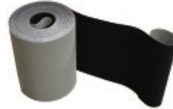
SWQTR5X30GY-10 Disposable Velcro ® Hook & Loop Self-Wrapping 5" x 30 Feet (Case of 10 Rolls) See Website for Additional Sizes