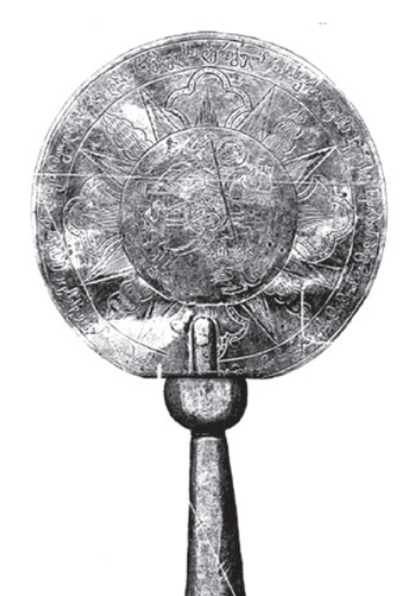
The upper part of the banner of Prince Konstantine Mukhranbatoni

According to a law enacted by King Vakhtang VI (1703-1724) of Kartli, the princes of Georgia had to be divided into three ranks: high, middle, and low. That the Mukhranbatonis had a princely origin is also evident from a list compiled by Vakhtang VI before his re-settlement in Russia in 1724. This list of royal retinue (amounting to approximately 2,000 people) included all the members of the royal