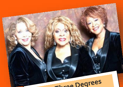
The Three Degrees 50 th Anniversary

A double platinum artist, a vocal stylist who traces her roots from jazz to blues to the great American Song Book and Standards to Disco. Her most famous recording, the Disco hit "#1 Dee Jay". The double platinum hit "Merry Christmas All," on Salsoul Records is a classic perennial favorite.