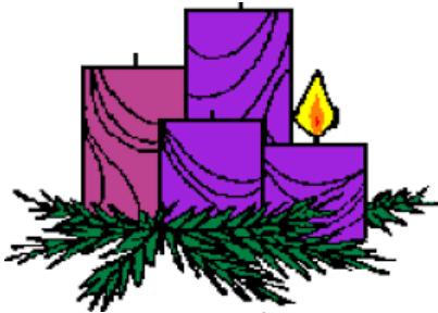
First Sunday Of Advent

Monday - 8:00AM Tuesday - 8:00AM Wednesday - 8AM & 6:30PM (Adoration 5:30-6:30PM Wednesday) Thursday - 8:00AM Friday - 8:00AM Saturday - 8:00AM Weekend Masses: Saturday 5:00PM Sunday 9:30AM & 7:00PM