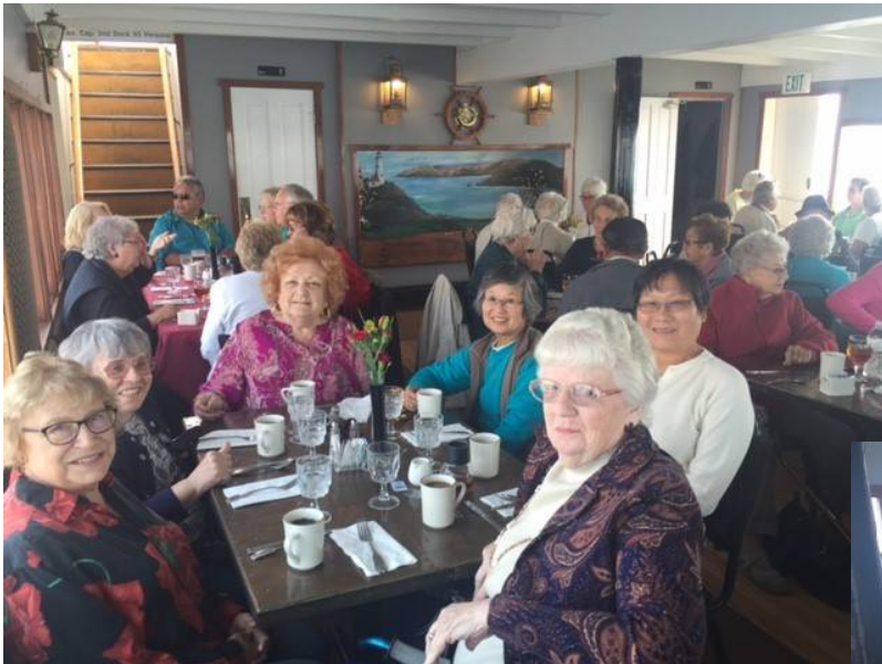
Members having fun on the August Big Sur trip and the lunch cruise on Morro Bay.