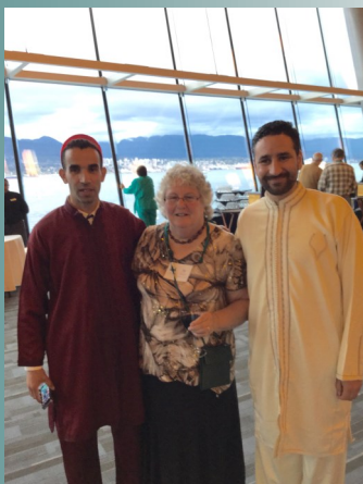
North Africa Ambassadors

The following photos show more of Sue Moyer's "World of Friends"